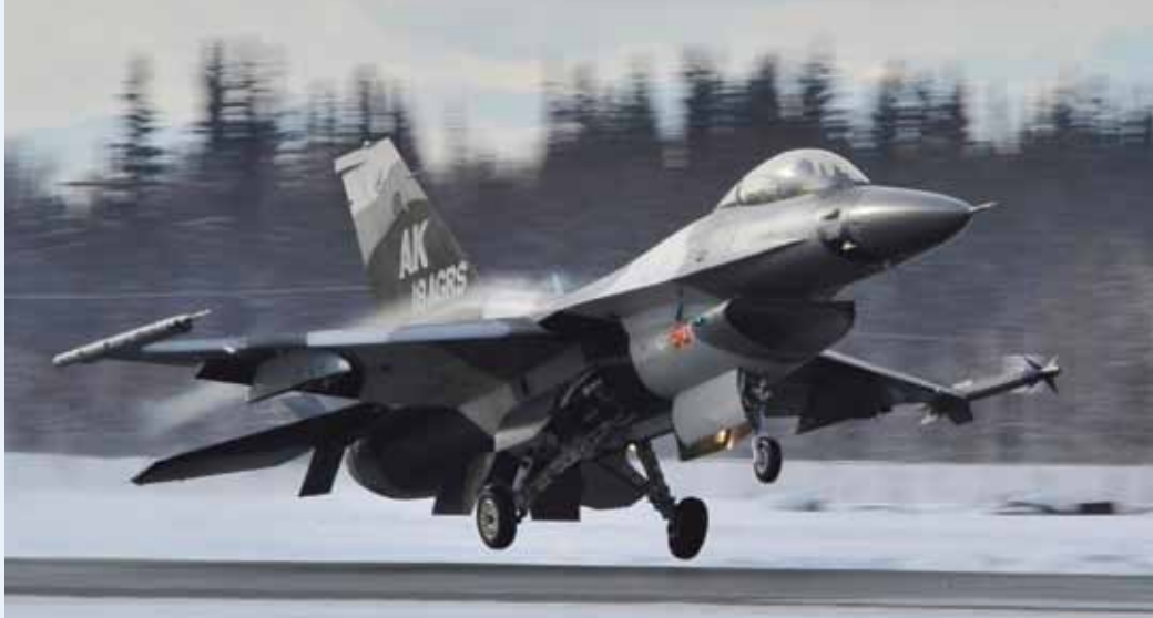
F-16C Fighting Falcon lands at Eielson Air Force Base during exercise Distant Frontier and Red Flag–Alaska

Maritime surveillance is another important role for ALCOM. Already, there is the long-established history of successful combined defense between the United States and Canada on airspace surveillance through NORAD. This relationship, along with its associated personnel and infrastructure, should be expanded to include maritime