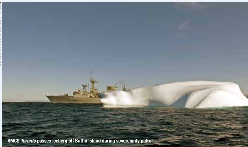
HMCS Toronto passes iceberg off Baffin Island during sovereignty patrol

Passage, which connects the Atlantic Ocean to the Pacific. By using this route ships cut huge distances off their transits. Nevertheless, the Northwest Passage is not without controversy—Canada is concerned about its use and regulation.