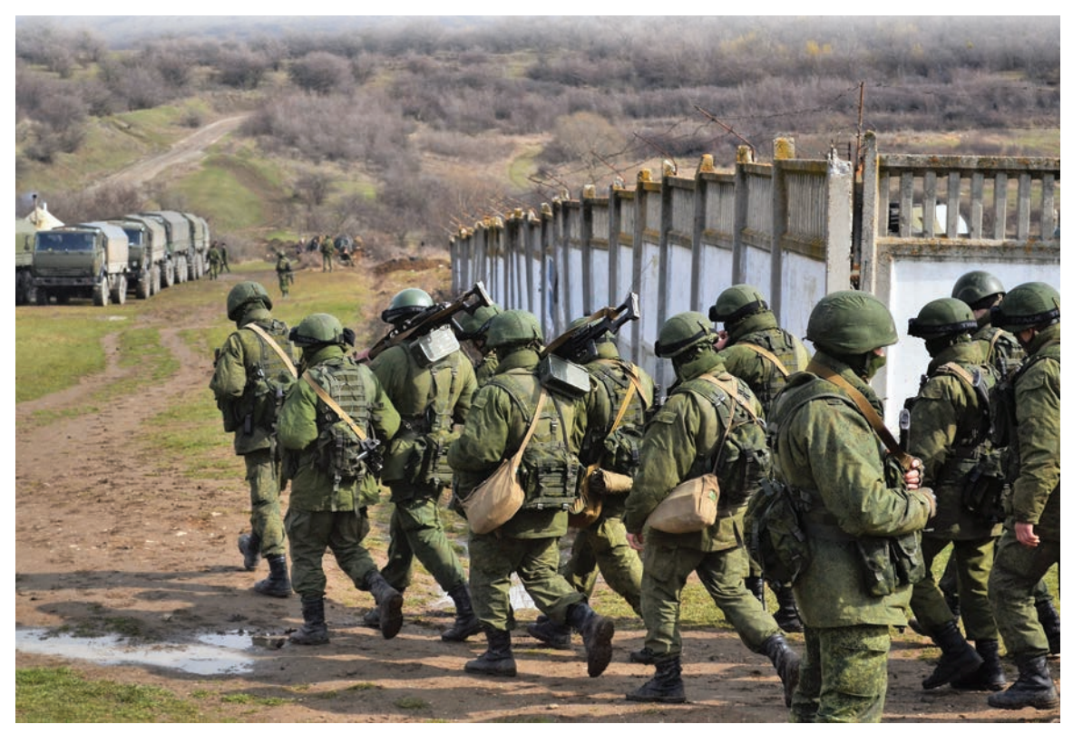
Russian soldiers marching on March 5, 2014 in Perevalne, Crimea, Ukraine. On February 28, 2014 Russian military forces invaded Crimea peninsula.

clear, Russia has maintained a relatively small military footprint in Syria. The RAND Corporation estimates that Russia has maintained fewer than 4,500 military personnel inside Syria throughout the conflict.<sup>31</sup> However, Russia's employment of PMCs increased its presence on the ground while providing plausible deniability at home and abroad and limiting its military commitment. Direct intervention was risky, as victory was not assured, and Russia risked economic and diplomatic blowback.