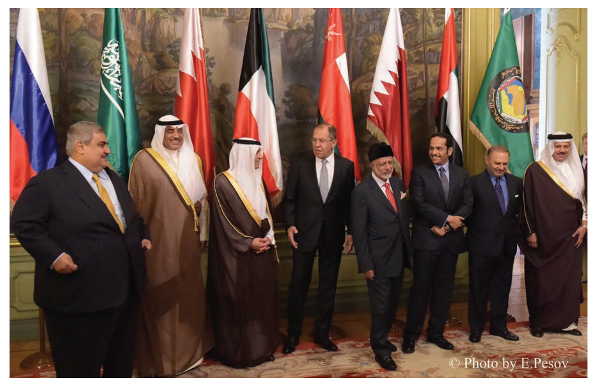
Russian Foreign Minister Sergey Lavrov took part in the 4th meeting of the Russia-GCC strategic dialogue." (the Russian Ministry of Foreign Affairs / MFA, May 26, 2016 (Creative Commons))

Looking to the GCC countries, Russia's ends are shaped by energy security and economic considerations. Russia's vital interests in the GCC are to prevent regional conflicts from damaging its bilateral relationships, to secure its position as a major player in the energy market, to increase trade and investment, to improve its political influence to counter the United States, and to seek assistance on Syrian reconstruction.53 Russia has primarily achieved increased influence with the GCC via energy price negotiations and arms sales. The United States has no counterpart to offer for Russian specialty systems such as the Pantsir family of self-propelled, medium-range, surface-to-air missiles and anti-aircraft artillery. With Houthi drone and missile attacks against Saudi and UAE interests, as well as asymmetric threats from Iran, these governments are seeking effective solutions. However, Russia is also interested