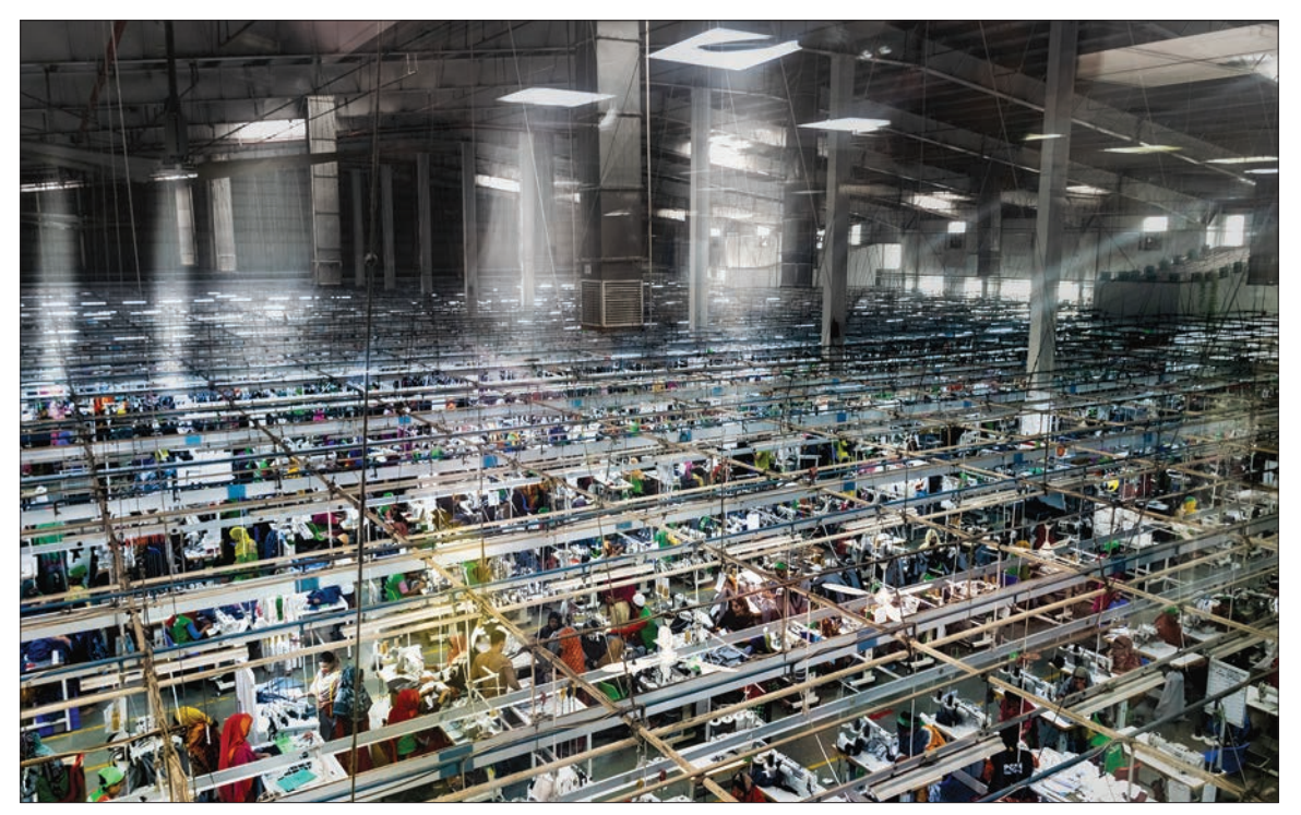
The highest LEED Certified Green Garment factories in the world. February 2, 2020

However, BRI also has major advantages. It puts mutual development at the core of China's policy and brand. Its roads, railroads, ports, and