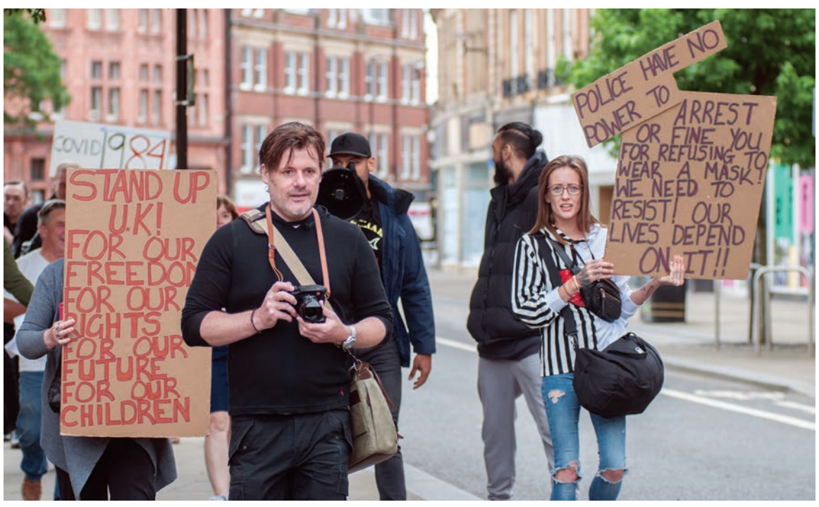
Anti-Mask Protest - Coronavirus (COVID-19) Sheffield, UK

foreknowledge and appropriate reaction—hearing but not listening. Warning is a deliberative act. It is being pro-active. Warning is more than writing an intelligence estimate or a scientific paper.