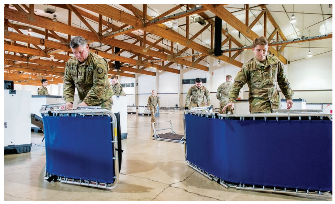
Oregon National Guard sets up Oregon Medical Station

to arrive at satisfactory contingency plans within national constitutional settlements.