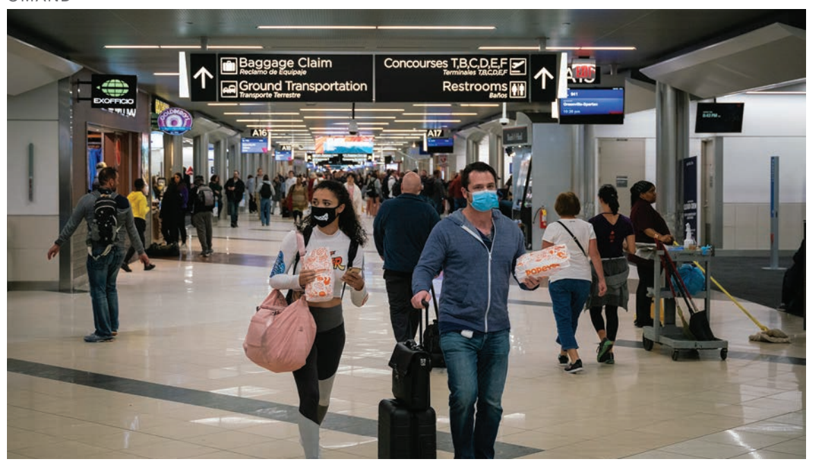
Flyers at Hartsfield-Jackson Atlanta International Airport wearing facemasks on March 6<sup>th</sup>, 2020 as the COVID-19 coronavirus spreads throughout the United States. (Chad Davis, March 6, 2020)

government itself in the midst of the inevitable confusion after a crisis has arrived. It is in those adverse circumstances that it really matters that the public already believes in the integrity and good intentions of a government and will follow its advice.