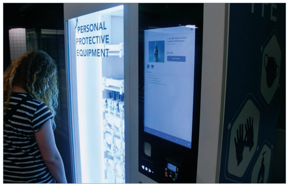
MTA Deploys PPE Vending Machines Across Subway System (Metropolitian Transit Authority of the State of New York, June 29, 2020)

their ability to execute their missions that may arise when there are disruptive global challenges.