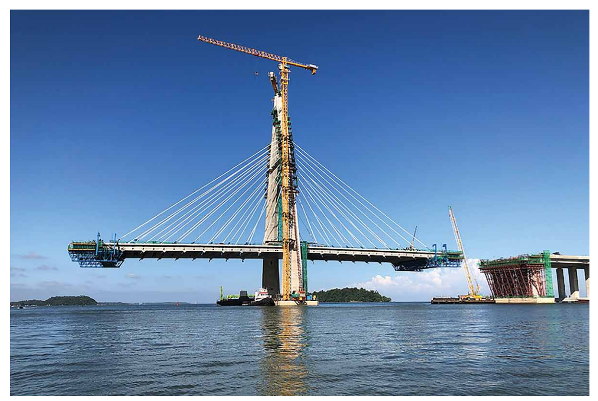
Part of China's Belt and Road Initiative, the partially completed bridge at the Kota Batu end of the Temburong Bridge construction project in Brunei. (Peter L. Higgs)

economic means;12 hence, economic power is seen as a means of generating greater political influence among the countries Beijing seeks to win over into its camp. The goal of economic initiatives (like the BRI) is linked to how Chinese leaders seek to present and project Beijing's worldview to others and to ultimately achieve China's foreign policy and domestic goals. This "selling" of Beijing's worldview is also closely linked to how Chinese soft power is being conceptualized and operationalized. While western iterations of soft power tend to emphasize the non-coercive aspect of soft power, and thus the stress on culture and values as instruments of soft power,<sup>13</sup> such a distinction as to whether economics ought to be seen as "hard" or "soft power" is less clear cut in China. According to one study, Chinese discourse concerning soft power is frequently expressed within its domestic context and towards