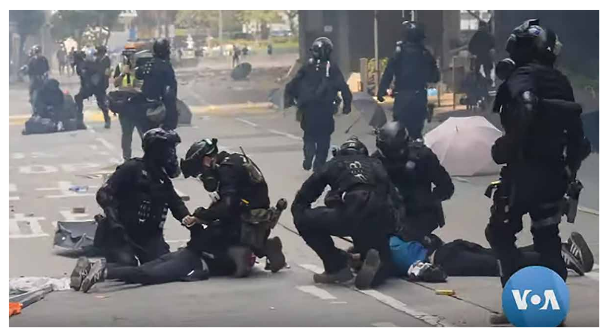
Police seemingly indiscriminately arrested protestors in Hong Kong on riot related charges. (Bill Gallo, VOA News, 18 November 2019)

coercing other countries into compliance with some aspects of its systemic goals. As noted above it is investing billions in a "global megaphone" of social media, broadcast entities, classic propaganda, and other forms of influence.<sup>60</sup>