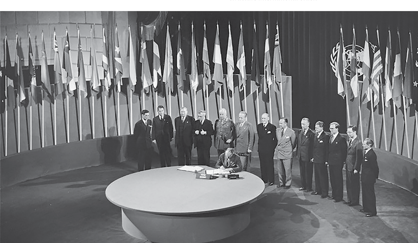
The 1945 San Francisco Conference at which 46 nations signed the United Nations Declaration establishing one of the key institutions of the post-war U.S.-led international system.

A hegemon cannot impose rules without securing a broad measure of consent through the production and reproduction of a legitimating ideology. The legitimating ideology serves to promote and protect the taken-for-granted rules and ideas that structure international order.<sup>39</sup>