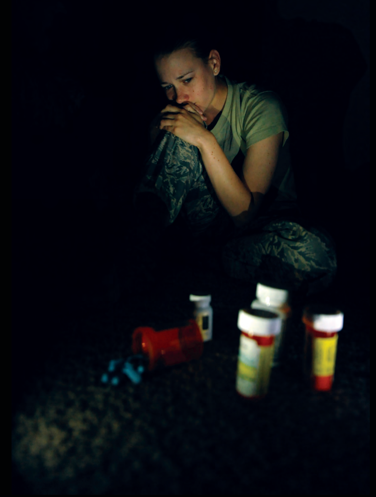
Members of the armed forces are not immune to the substance use problems that affect the rest of society. Most of the prescription drugs misused by service members are opioid pain medications.