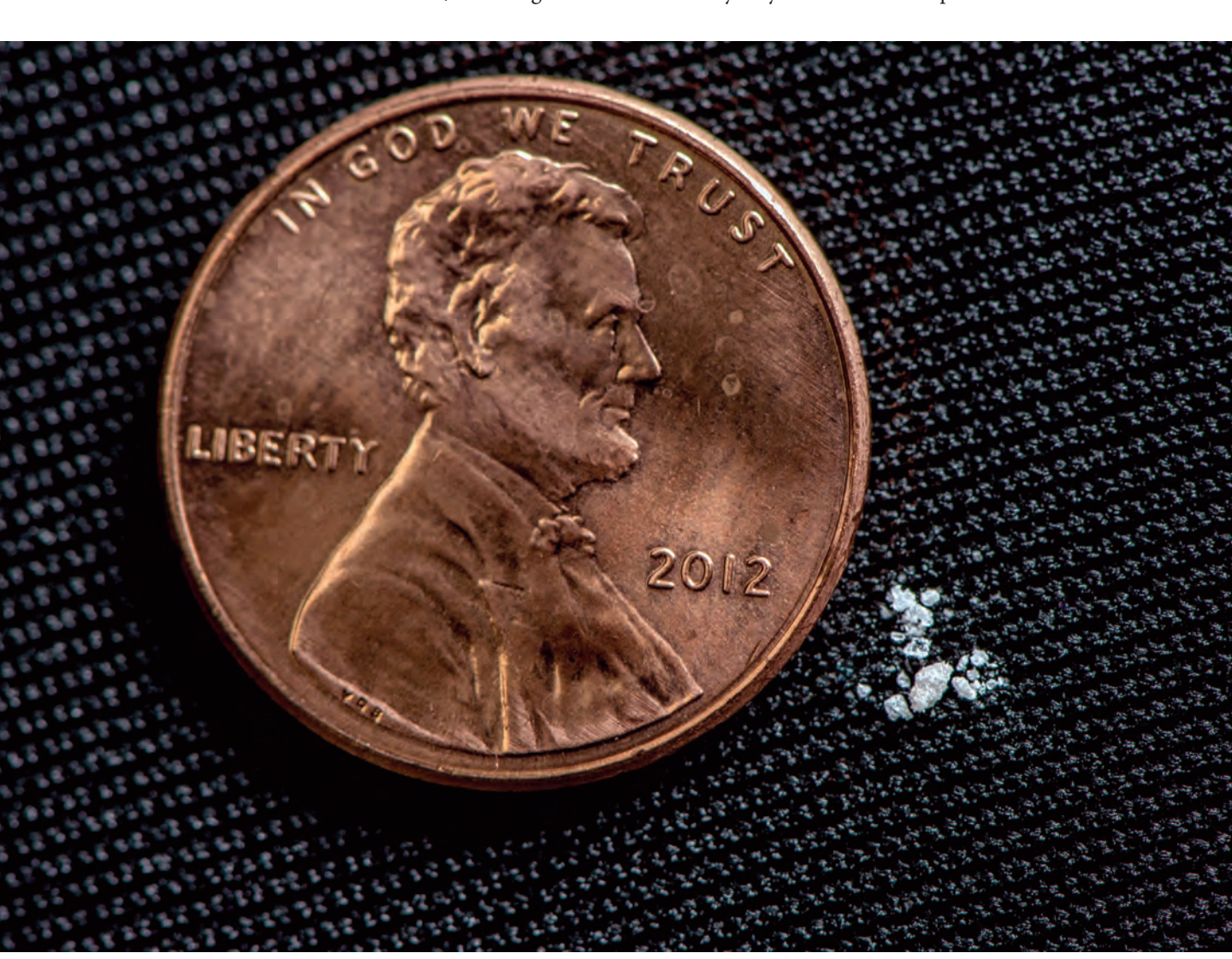
Comparison of a U.S. penny to a potentially lethal dose of fentanyl.

the mail, with Mexico and China serving as the major sources. Based on U.S. Customs and Border Protection seizure data, China is the principal source country of illicit fentanyl and fentanyl-related compounds in the United States, including both scheduled and non-scheduled substances.<sup>13</sup> Fentanyl analogues and precursor chemicals used to make fentanyl are illicitly manufactured in Chinese labs and then sold on the dark web and shipped in bulk to the United States and Mexico. The anonymity and decreased exposure to law