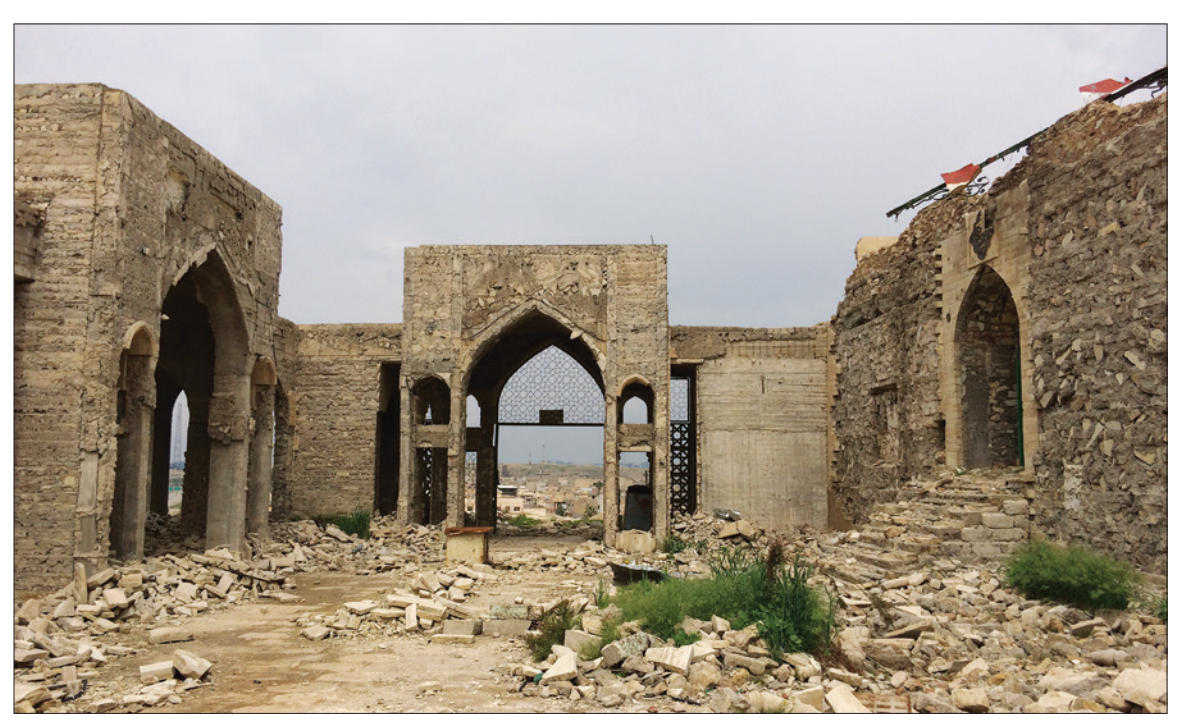
This image was taken in April 2017 during a UNESCO mission to Nineveh, Iraq, which was heavily destroyed and excavated by ISIS. Destruction of cultural heritage and archaeological looting is a global issue that threatens the preservation of our shared cultural heritage. Nineveh, Iraq, April 3, 2017. Photo by UNESCO (https://commons.wikimedia.org/wiki/File:UNESCO_mission_to_Nineveh,_Iraq,_April_2017.jpg).

The directive also states that, "[p]owerful images of CP destruction, such as the destruction of World Heritage sites, have become tools of Information Warfare. Therefore, failure to protect CP may have tactical and strategic consequences" and that the "[d]estruction of CP may hamper reconciliation and healing of societies after conflict." The directive here echoes United Nations Security Resolution 2347 (2017), which stated that, "The unlawful destruction of cultural heritage (...) can