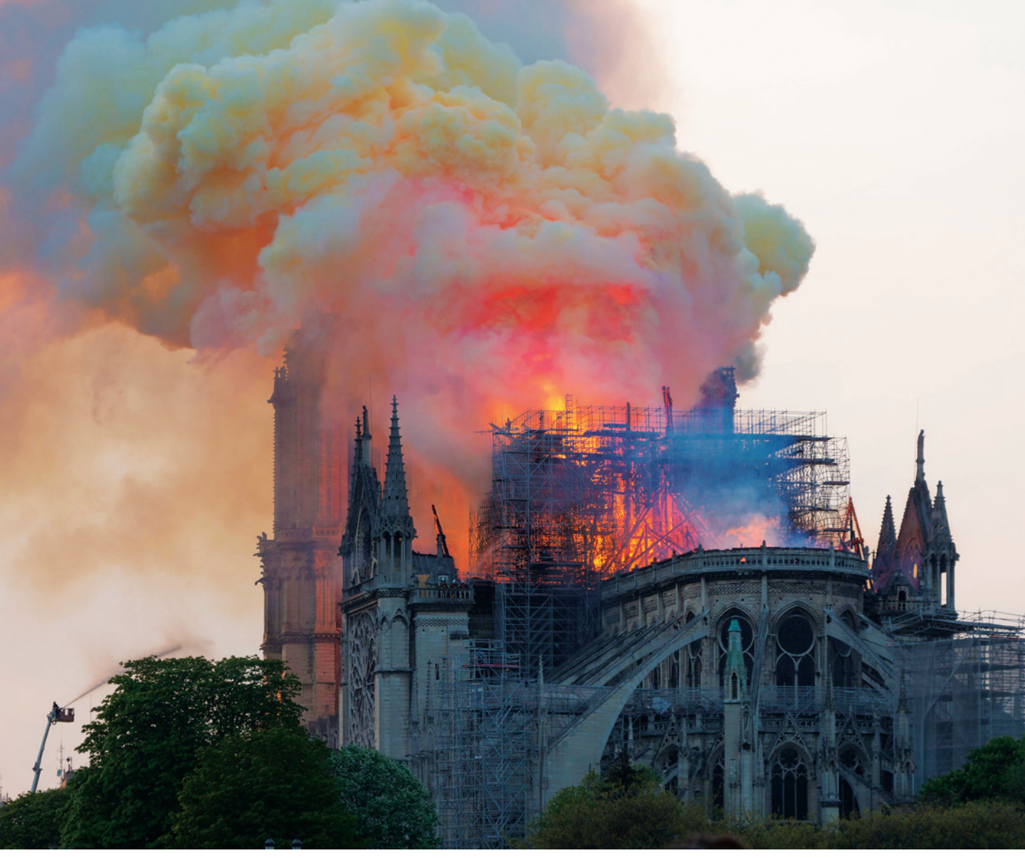
Huge fire scars beloved Notre Dame Cathedral in Paris, France, April 15, 2019.

security, communications, and financial systems. But "softer" vulnerabilities such as legitimacy, core values and liberties, societal cohesion, and minorities' rights have not yet been recognized and adequately protected against hybrid activities.