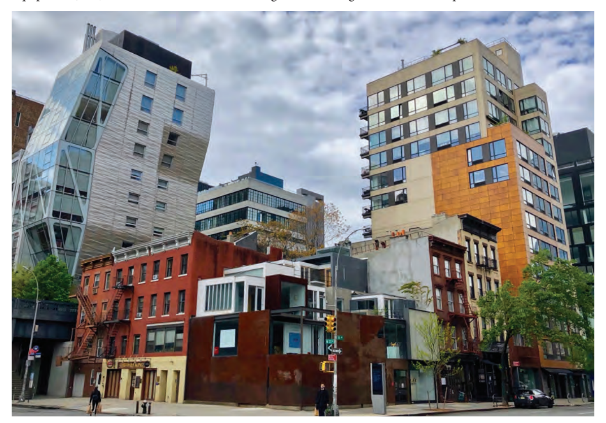
Socially distanced: New York City under quarantine. Empty streets on a mid-May afternoon in Chelsea.

Again, all of this was predictable. The need for