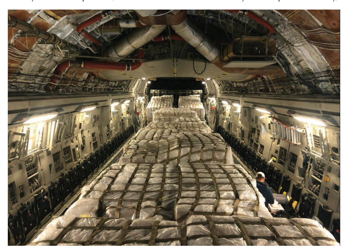
As part of a U.S. Department of Health and Human Services-led, whole-of-government effort, AMC transported a shipment of 13 pallets containing 500,000 COVID-19 sampling swabs aboard a 164th Airlift Wing C-17 Globemaster III from Aviano Air Base, Italy, to the Memphis, TN, Air National Guard Base, March 17, 2020.

Like learning to live with a new disability, we will also need to adjust and compensate socio-economically. The sad math of calamity is that the injured and disabled, who often require long-term care and support, significantly outnumber those killed.<sup>23</sup> We are only now beginning to understand the long-term effects associated with even mild cases of COVID-19. At the same time, we are experiencing a marked increase in PTSD, suicides, divorces, and broken families, all of which burden our economy and lives. For example, compensation costs for Vietnam veterans and families are still $22 billion annually.<sup>24</sup> Despite grafting healthy economic flesh over our society's afflicted parts and economy,