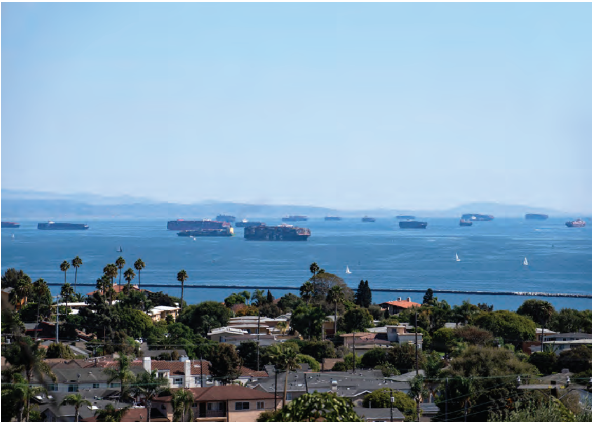
Dozens of container ships waiting at sea to unload at the Port of Los Angeles.

As will be discussed in the next section, both federal funding and defense funding helped to support the global supply chain. Nevertheless, companies have continued to exhibit concerns.