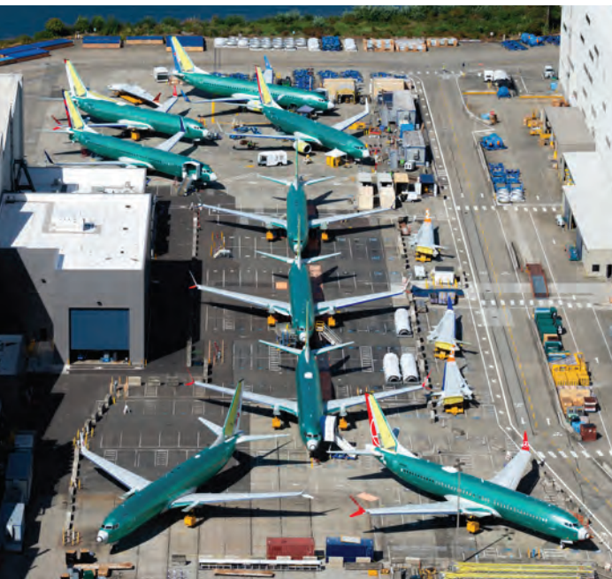
Multiple Boeing 737 MAX and NG parked outside the company factory at Renton Airport.

Boeing has several key segments, which include: the Commercial Airplanes segment; the Defense, Space and Security segment; and the Global Services segment. Due to the steep declines in the Commercial Airplanes segment in 2020, partially