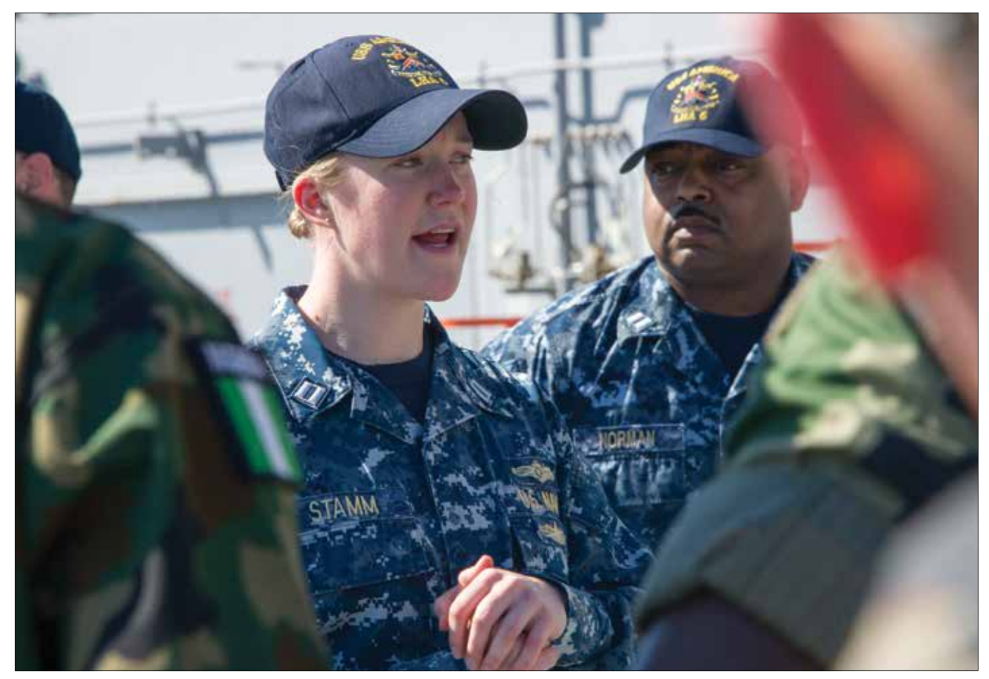
Navy officer answers questions from U.S. and international students of U.S. Army War College during tour of USS America, San Diego, California, March 1, 2017

Meiser note, it is useful to define strategy, especially grand or national strategies, as a theory of success.<sup>29</sup> Given that their purpose is rarely to defeat an adversary but instead is to develop institutional muscle and apply statecraft to desire strategic ends, this is more compelling than victory (and defeat) per se.<sup>30</sup> The common benefit from both concepts is the requirement to define, in general terms, the causal relationship that converts ways and means into the desired end(s) for testing during strategy refinement.