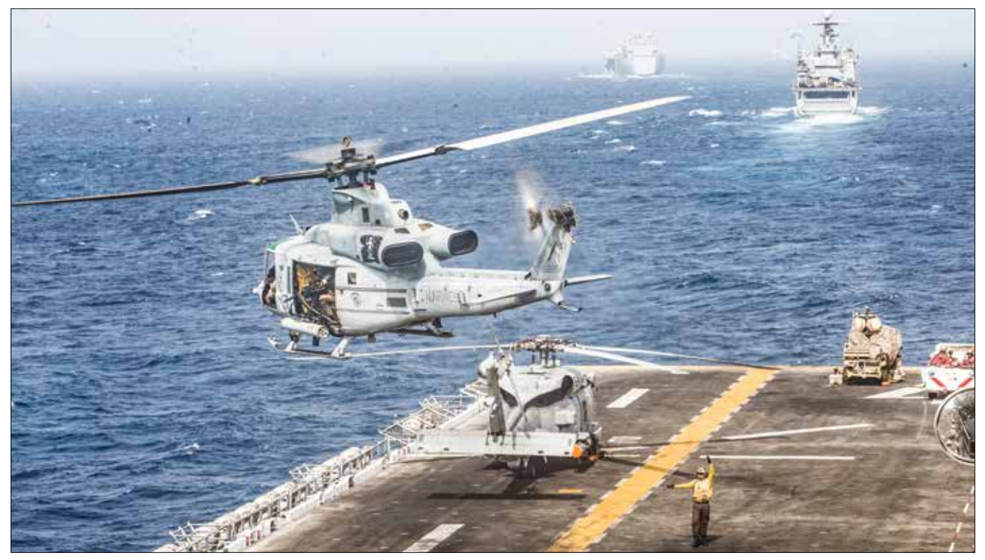
UH-1Y Venom helicopter takes off from flight deck of USS Boxer, Strait of Hormuz, July 18, 2019

Some academics dismiss national strategies as vain and hubristic, more grandiose than practical plans to obtain goals. Others criticize the tendency in U.S. policy circles to confuse grandiose objects and rhapsodic prose with pragmatic plans and appropriate means. But others contend that policymakers and their military advisors cannot escape the need to intelligently craft strategies to advance the Nation's interests. As Hal Brands notes, "grand strategy is neither a chimera nor an elusive holy grail, but rather an immensely demanding task that talented policymakers have still managed to do quite well."3