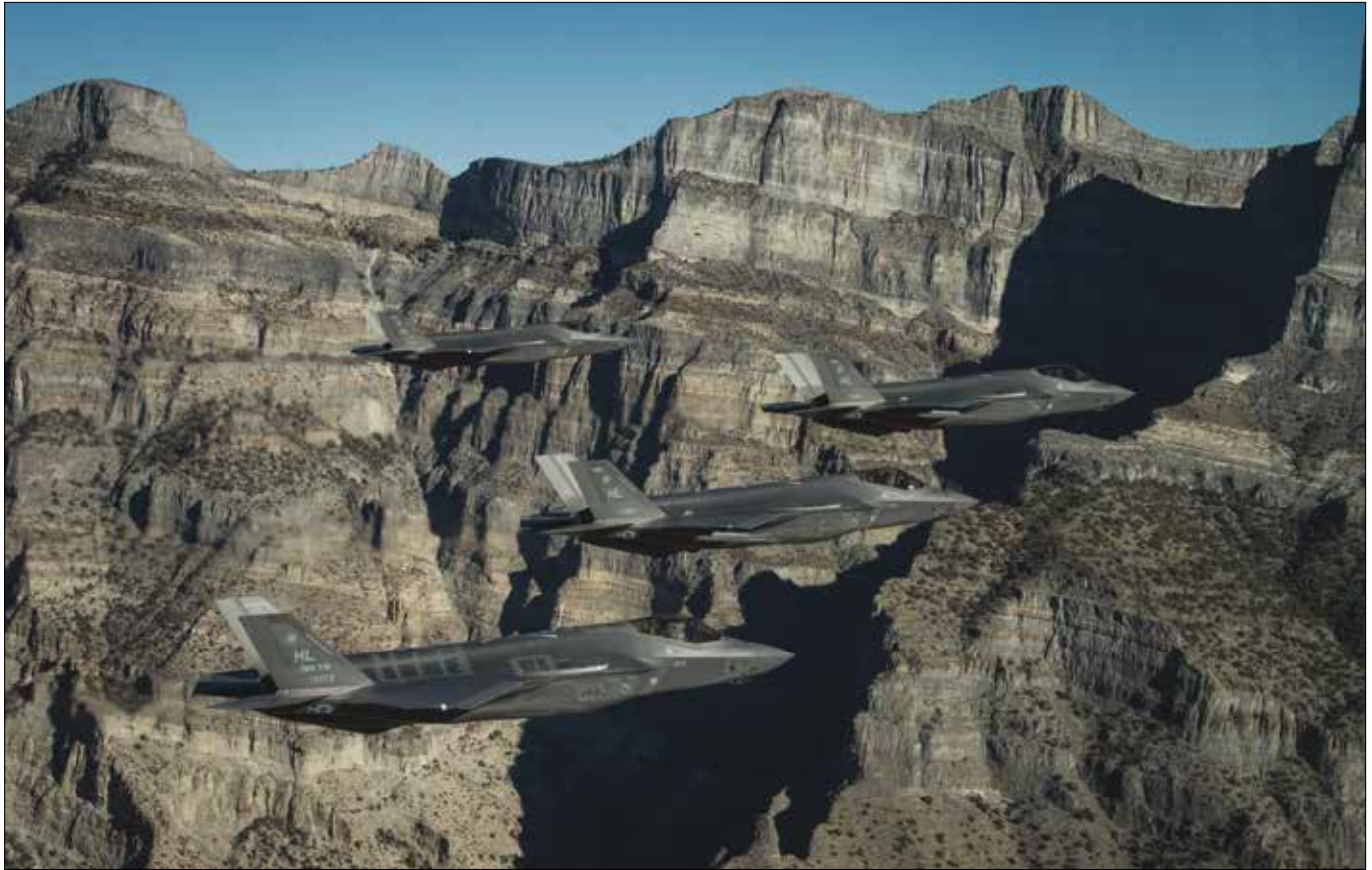
Formation of F-35 Lightning IIs from 388 th and 419 th Fighter Wings stationed at Hill Air Force Base performs aerial maneuvers during combat power exercise over Utah Test and Training Range, November 19, 2018

impedes operational effectiveness rather than enables it. Second, the operational context —the mission, the enemy, and the environment within which formations fight—is a critical factor in determining how a commander should organize command. Decentralized command is not desirable or effective in every operational context. 14