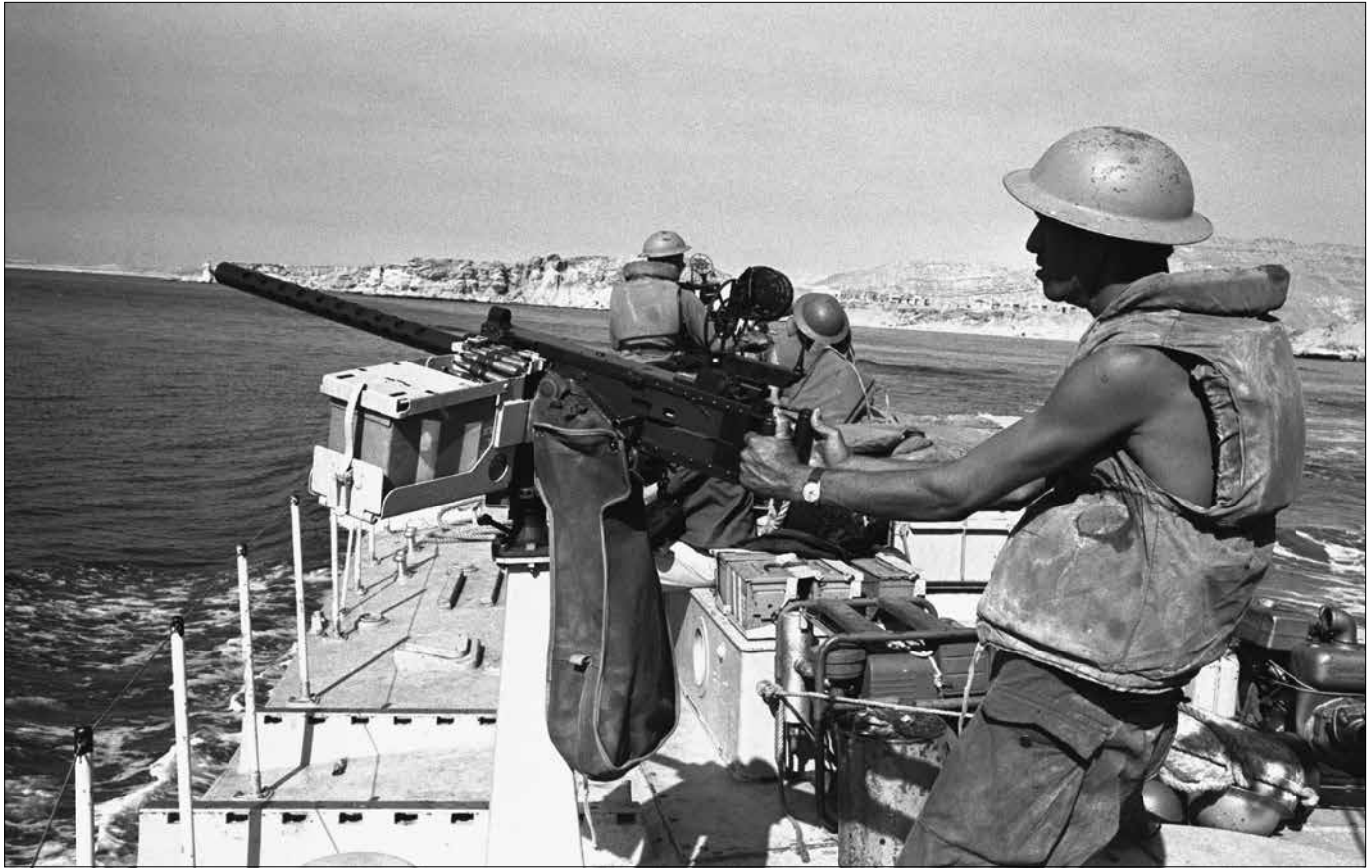
Israeli gun boat passes through Straits of Tiran near Sharm el-Sheikh during Six-Day War, June 8, 1967

decentralization. This static approach fails to account for the dynamic nature of operational context. It also frequently results in overly centralized control because many Army commanders lack trust in subordinates, are uncomfortable with uncertainty, and are risk-averse.