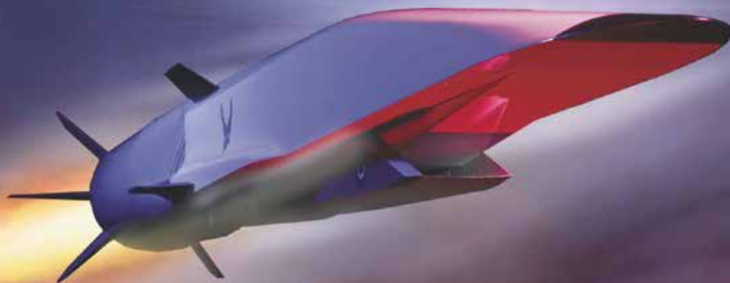
X-51A Waverider, powered by Pratt Whitney Rocketdyne SJY61 scramjet engine, prepares for hypersonic flight by riding its own shockwave, accelerating to nearly Mach 6 (U.S. Air Force graphic)