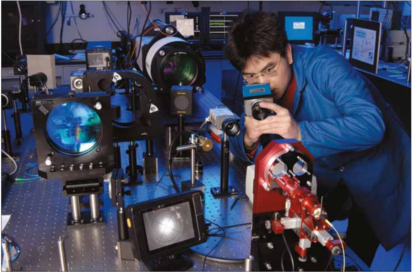
Army Research Laboratory's electronics program seeks to generate knowledge of electromagnetic, photonic, and acoustic devices, systems, and phenomena to provide technological superiority to Army's future force

fact, business as usual will lose the fight. We must change how we operate in order to maintain our technological lead. We must retool how we do the hard business of discovering, developing, and fielding new capabilities, at sufficient scale, for our warfighters. And we must do all of this quickly. The bottom line is that we must radically adapt our laboratories to today's S&T environment, embracing risk and eschewing the status quo. This is America's national challenge at this unique moment in history, as urgent as any we have faced before.