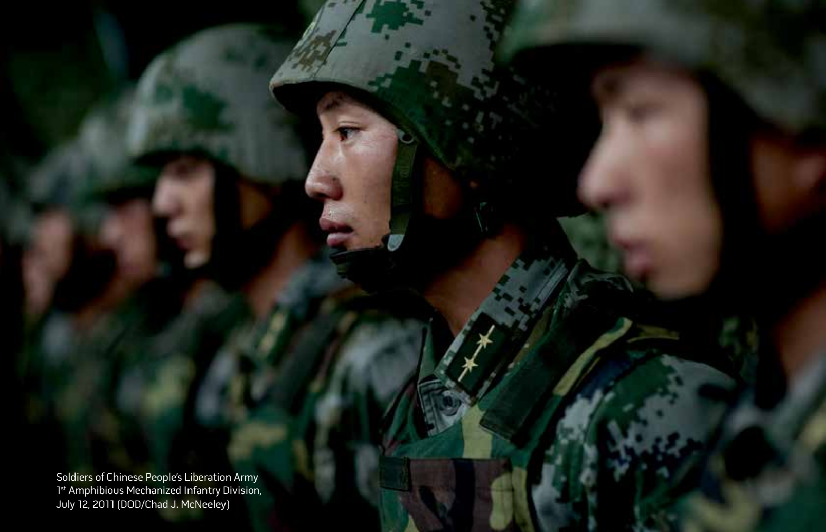
Soldiers of Chinese People's Liberation Army 1 st Amphibious Mechanized Infantry Division, July 12, 2011