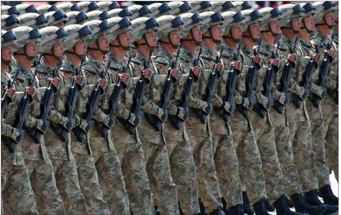
Chinese troops during military parade marking 70 th anniversary of victory of “Chinese People’s Resistance against Japanese Aggression and World Anti-Fascist War” at Tiananmen Square, Beijing, September 3, 2015

the PLA carried out a major propaganda offensive to cultivate a reform mindset among rank-and-file PLA personnel. 20 An anti-corruption campaign was also under way within the PLA, targeting both senior and more junior officers (known colloquially as “tigers” and “flies”). This latter effort served to put the PLA on notice that resistance to reform would not be tolerated.