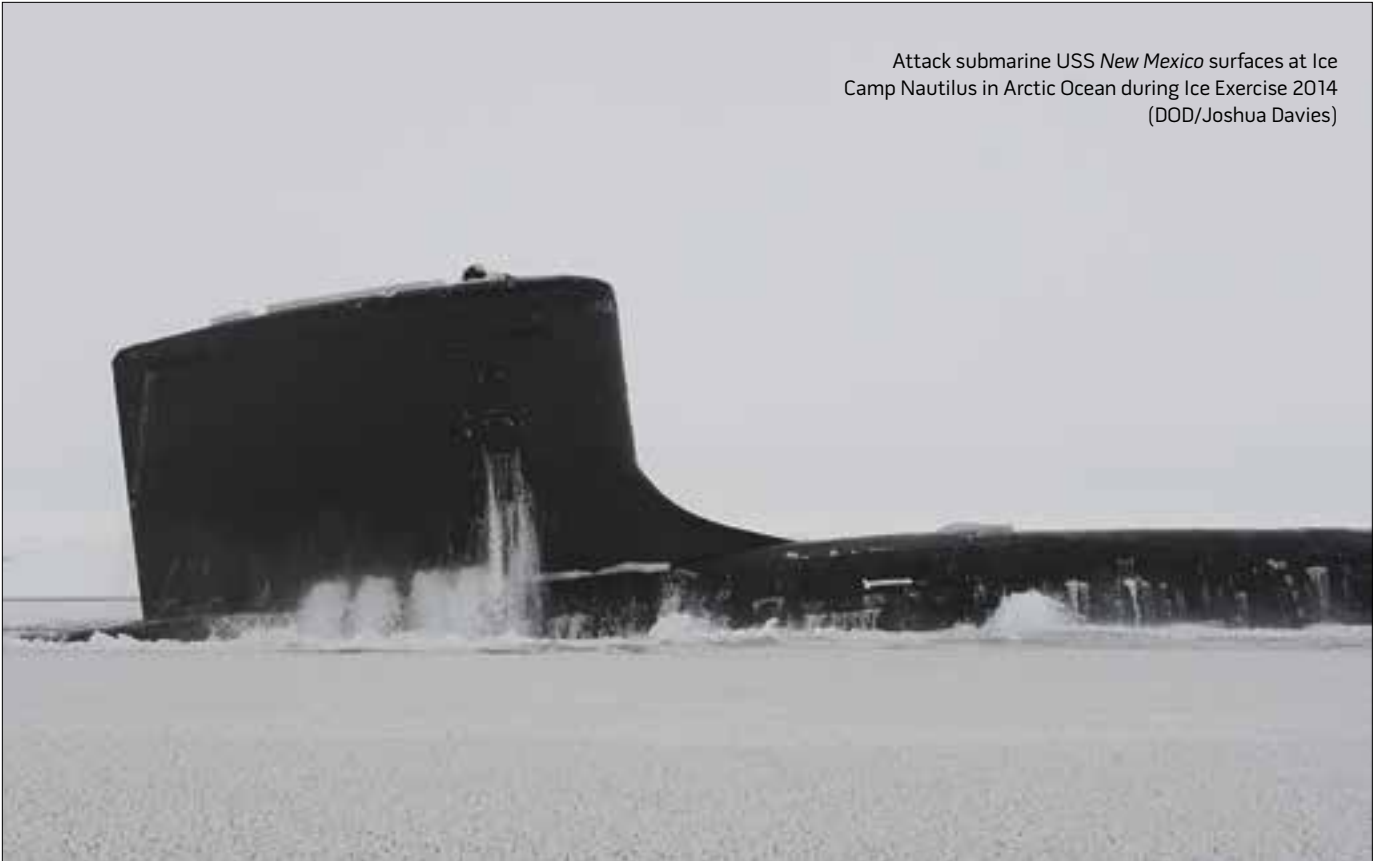
Attack submarine USS New Mexico surfaces at Ice Camp Nautilus in Arctic Ocean during Ice Exercise 2014

policy almost by default. The Arctic is a complex environment, and a report by the Arctic Institute noted that “the armed forces, beyond their responsibility for handling all contingencies, are also the only agencies with both the requisite monitoring instruments and the physical capabilities to operate in such a vast and inhospitable region.” 41 A further concern is that the Arctic is an environment of extreme operational challenges, even for armed forces with longstanding Arctic experience. 42 These problems range from limited communications due to magnetic and solar phenomena that reduce radio signals to environmental degradation of personnel, weapons systems, and navigation equipment. Considering the nature of SOF, with their recruitment of more experienced personnel, a rigorous selection process, high resilience, and extensive training to achieve proficiency in applicable mission sets, these elite units offer the innovative, low-cost, and small-footprint approach needed to achieve nuanced national security objectives in a challenging region. 43