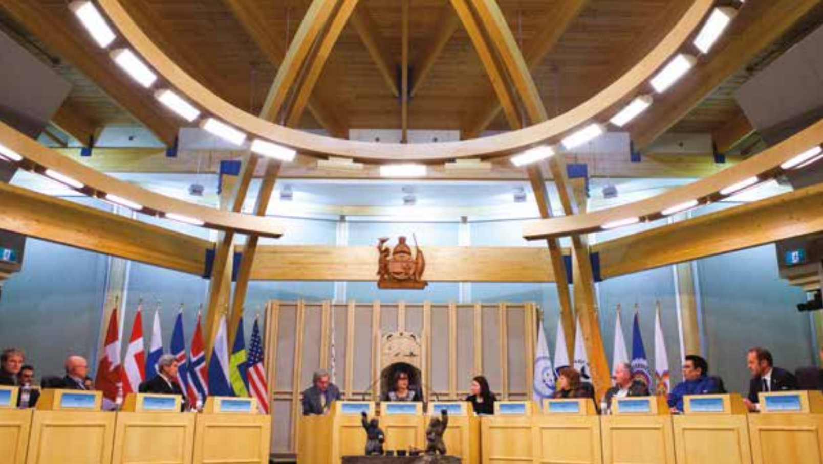
Secretary Kerry listens as Arctic Council Chairman Leona Aglukkaq of Canada relinquishes council chairmanship to the United States during meeting of its eight member nations and seven Permanent Representatives, April 2015