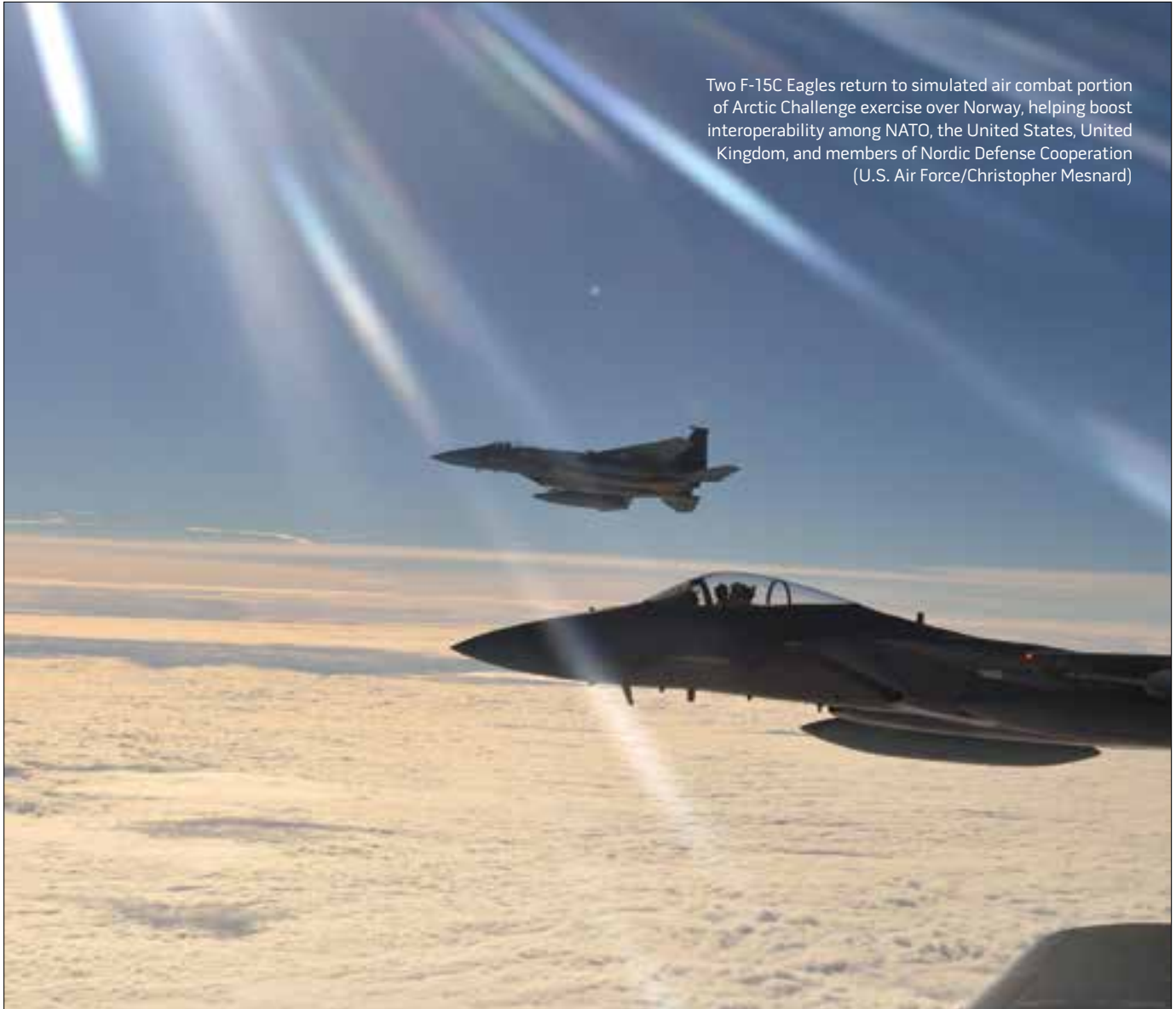
Two F-15C Eagles return to simulated air combat portion of Arctic Challenge exercise over Norway, helping boost interoperability among NATO, the United States, United Kingdom, and members of Nordic Defense Cooperation

support. Possible units of action for this assignment are U.S. Air Force Special Operations, MC-130P aircraft squadrons, and related CV-22 tiltrotor units, coupled with selected SOF pararescuemen and combat rescue officers from the special tactics squadrons. By locating such assets at Thule Air Base in Greenland and Joint Base Elmendorf-Richardson in Alaska, selected air SOF units could provide air coverage and support for most of the North American Arctic and Northwest Passage. Although the Air Force has assets in its conventional Service with similar profiles and equipment, air SOF may be better suited for a niche Arctic mission because of