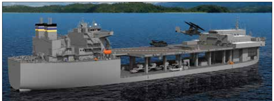
(Top) USNS Lewis B. Puller , Mobile Landing Platform–3/Afloat Forward Staging Base–1, under construction at General Dynamics National Steel and Shipbuilding Company shipyard; (below) artist's conception of MLP/AFSB with departing V-22 Osprey

We can also be smarter about developing shared sensor payloads and common control systems among our programmers while we find imaginative ways to better work the ISR “tail.” Each Service should be capitalizing on the extraordinary progress made during Operations Iraqi Freedom and Enduring Freedom in integrating sensors, software, and analytic tools. We should build off those models, share technology where appropriate, and continue to develop capability in this area among joint stakeholders.