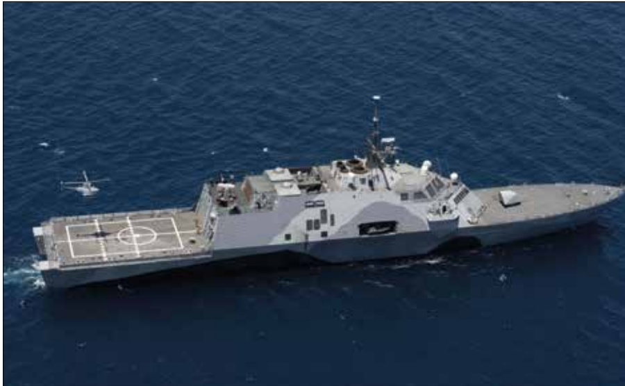
USS Freedom , Littoral Combat Ship 1