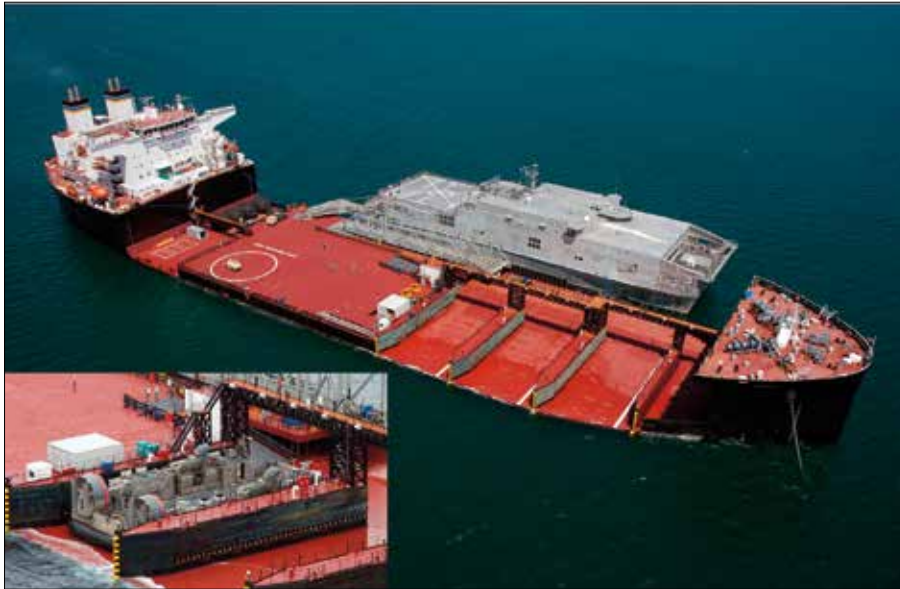
Newest naval platforms include Joint High Speed Vessel, Mobile Landing Platform, and Landing Craft Air Cushion

and information security capabilities are shared across the force will require heightened awareness, focused planning, inclusive coordination, and enlightened leadership for years to come.