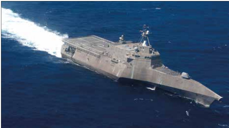
USS Independence , Littoral Combat Ship 2

The Air-Sea Battle (ASB) concept, and the capabilities that underpin it, represent one example of an opportunity to become more interdependent. While good progress has been made on developing the means, techniques, and tactics to enable joint operational access, we have much unfinished business and must be ready to make harder tradeoff decisions. One of the principles of ASB is that the integration of joint forces—across Service, component, and domain lines—begins with force development rather than only after new systems are fielded. We have learned that loosely coupled force design planning and programming results in costly fixes. In the pursuit of sophisticated capability