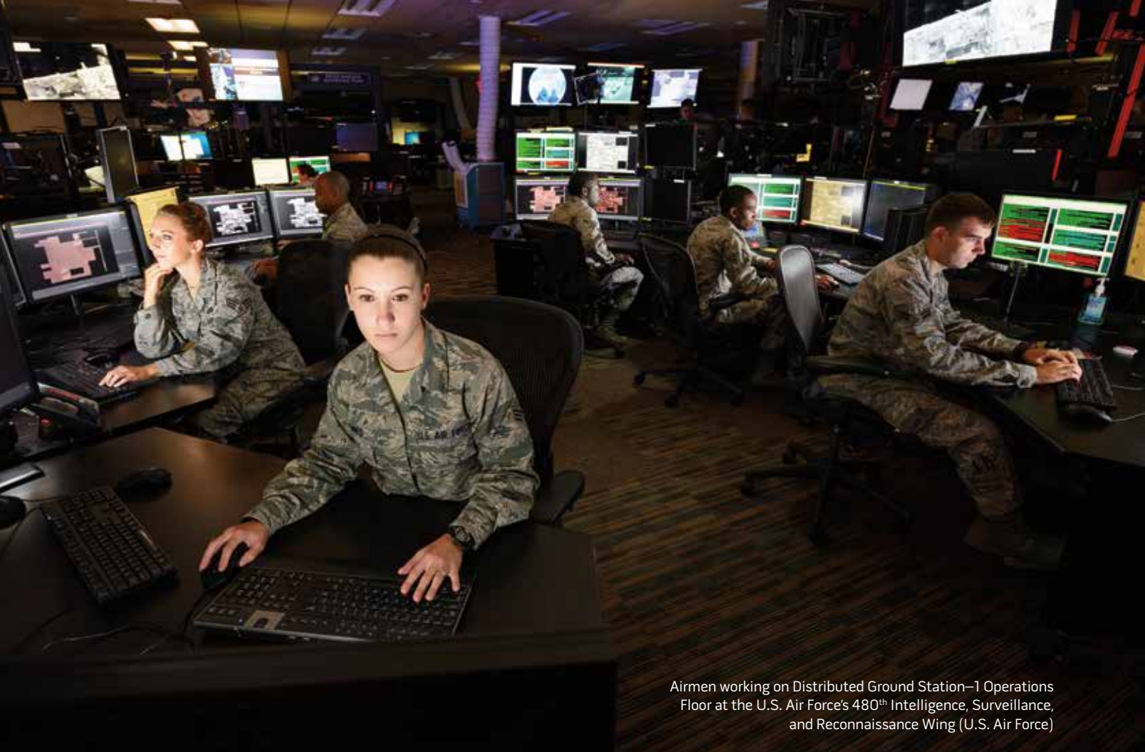
Airmen working on Distributed Ground Station–1 Operations Floor at the U.S. Air Force's 480 th Intelligence, Surveillance, and Reconnaissance Wing