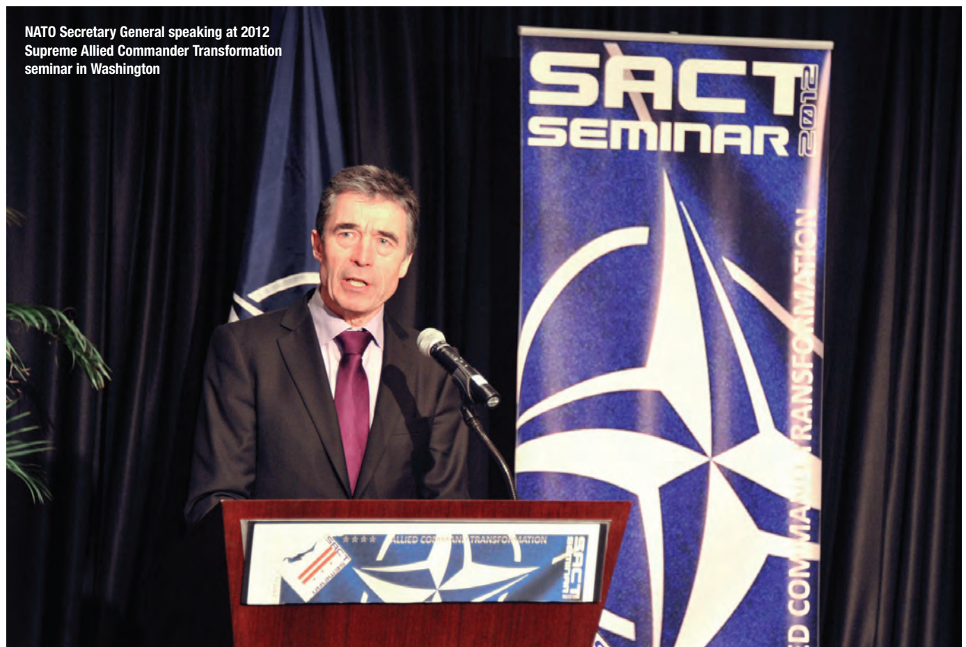
NATO Secretary General speaking at 2012 Supreme Allied Commander Transformation seminar in Washington

This strategic statement offered a new concept for a new century, and was immediately put to the test with the NATO operation in Libya, Active Endeavor. NATO