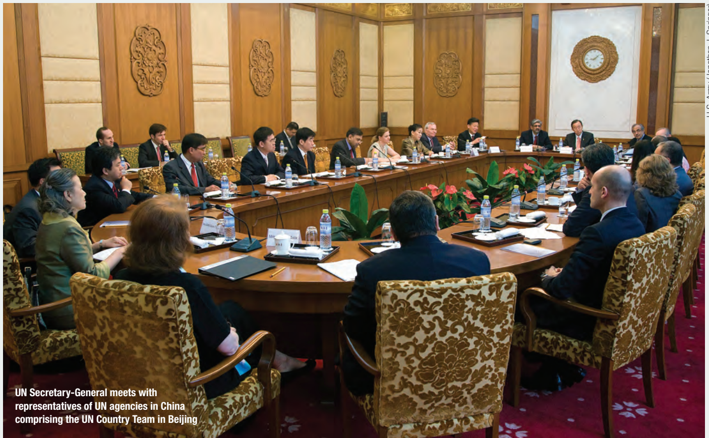
UN Secretary-General meets with representatives of UN agencies in China comprising the UN Country Team in Beijing

China's Weak Financial System. Ownership of financial institutions is dominated by the state, leaving one to question the financial sector's ability to serve the private sector and whether lending decisions are based purely on commercial considerations or the whims of the party. 28 McGregor remarks that Chinese banks are not just commercial institutions; they are also "instruments of national economic policy." 29 It is revealing that in 2009, when confronted with possible major economic decline, the CCP ordered the state-owned and "controlled"