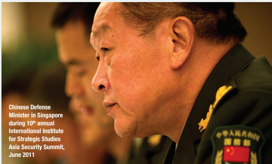
Chinese Defense Minister in Singapore during 10 th annual International Institute for Strategic Studies Asia Security Summit, June 2011

The list of imaginary economic perils that China poses to the United States is as lengthy as it is troubling. However, the bases for the alleged threats are laden with logical fallacies. The most significant misunderstanding surrounds the notion that if China is growing—winning—economically, the United States is somehow losing. Many are