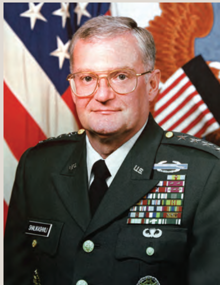
General John M.D. Shalikashvili, USA