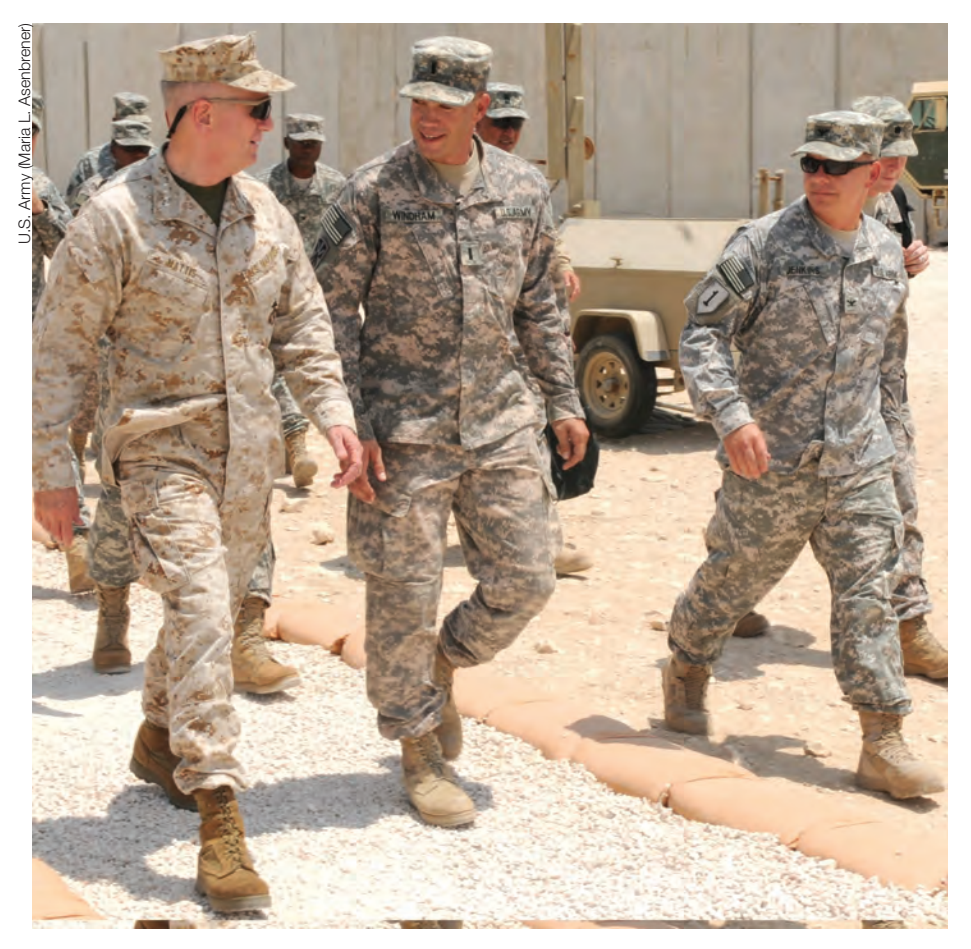
USCENTCOM Commander General James Mattis is briefed by Soldiers at Patriot missile site in Southwest Asia

appropriate for Cold War policies, it is not an effective way to confront 21st-century issues, and it is certainly not conducive to a whole-of-government, environment-shaping approach to national security policy.<sup>24</sup>