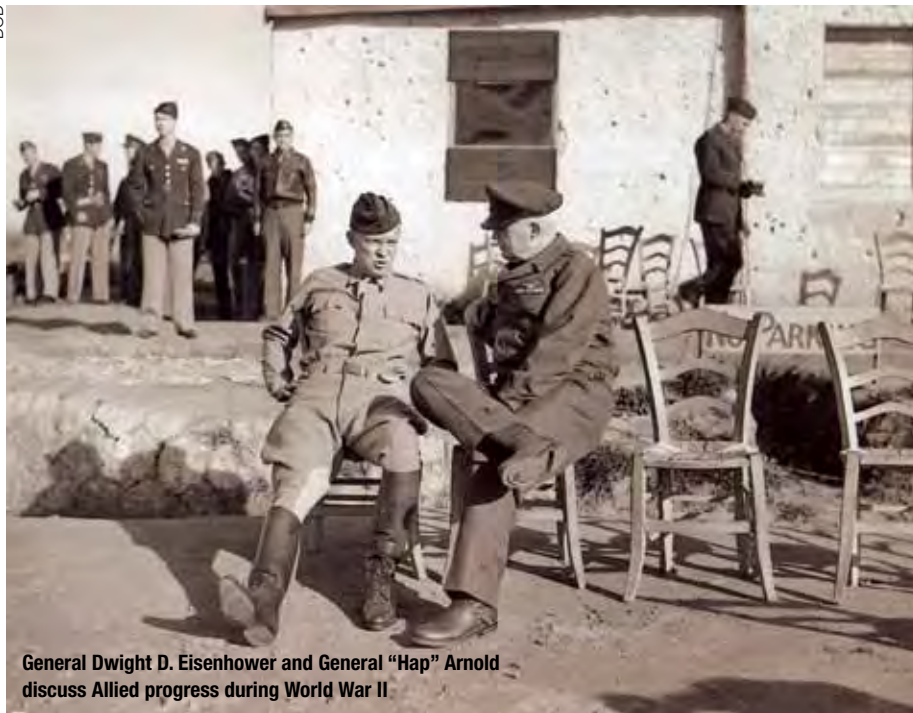
General Dwight D. Eisenhower and General "Hap" Arnold discuss Allied progress during World War II