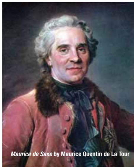
Maurice de Saxe by Maurice Quentin de La Tour