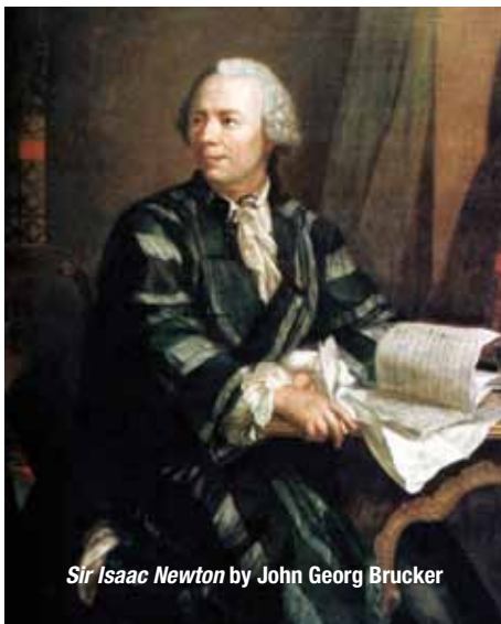
Sir Isaac Newton by John Georg Brucker

J.F.C. Fuller was greatly influenced by well-known philosopher and Darwinian Herbert Spencer. He wrote The Foundations of the Science of War and The Reformation of War in response to what he saw as a failure of military theory in World War I. 23 Spencer's vision of an orderly, deterministic universe led Fuller to think that war is a