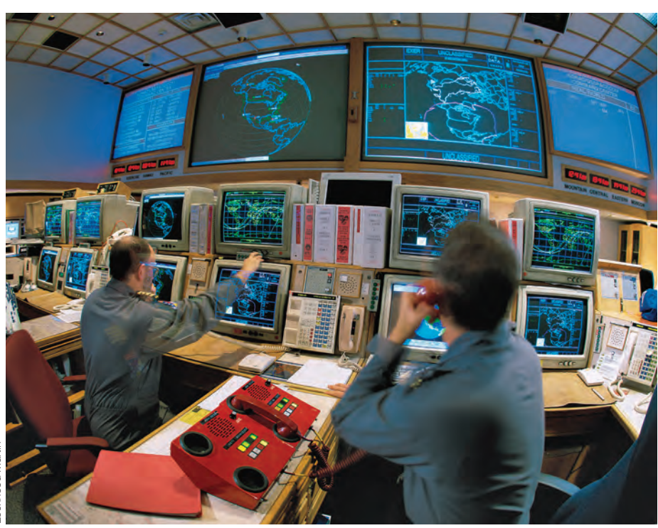
Modernization of U.S. Air Force Integrated Space Command and Control program will result in "virtual command center"

• Denial is the temporary elimination of some or all of a space system's capability to produce effects, usually without physical damage.