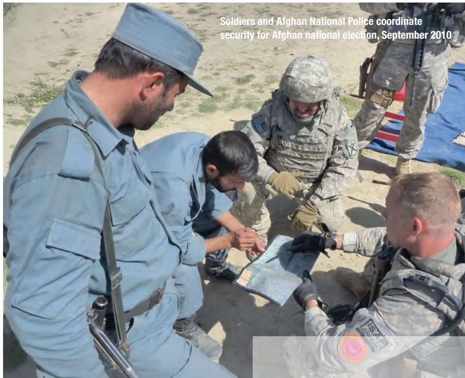
Soldiers and Afghan National Police coordinate security for Afghan national election, September 2010