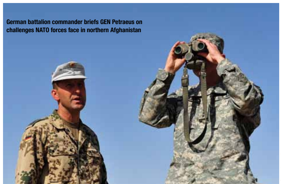
German battalion commander briefs GEN Petraeus on challenges NATO forces face in northern Afghanistan

In generic terms, leadership can be described as the art of direct and indirect influence and the skill of creating the conditions for sustained organizational success in achieving desired results. 29 In contrast to leadership, management deals with the allocation and control of resources, whether human, materiel, or financial, in order to attain the objectives of an organization. Good management skills require neither an overabundance nor a shortage of resources. 30 The objective of management is to make people capable of joint performance through common goals, common values, correct structure, and training and development. 31 The superiority in materiel was one reason the U.S. military traditionally emphasized management thinking and a business approach to solving military problems. Among other things, the prominence of managerial values and entrepreneurial ethics was the main reason for the inability of U.S. Army officers to perform well in Vietnam. 32 Leadership is one of the most critical yet most complex aspects of warfare. The higher the level of command, the more