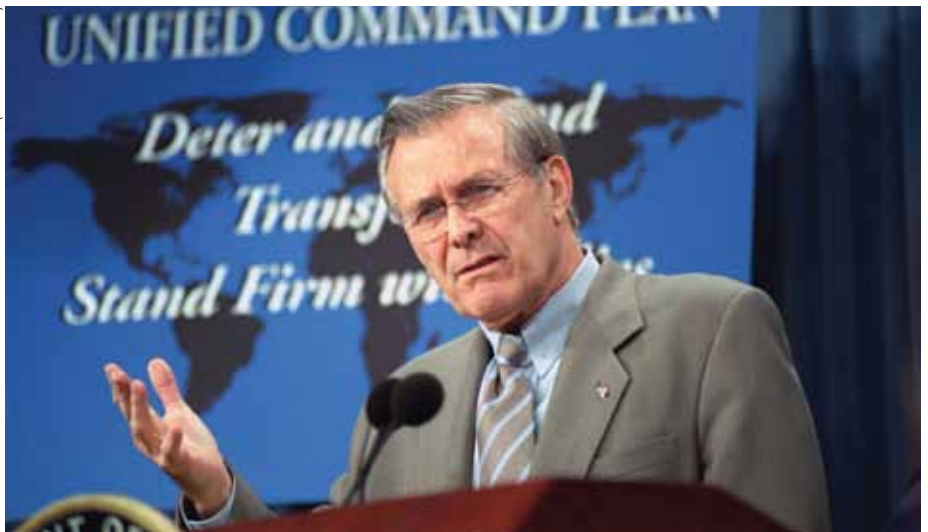
Secretary Donald Rumsfeld briefs reporters on changes to Unified Command Plan, April 2002

The human element is the single most critical element of warfare. War is lost or won by humans and not by machines. In contrast to a business organization, humans in the military live and work in close proximity to each other. There is far less room for privacy than is the case in civilian life. The success of a military force in combat is largely dependent on small-unit cohesion. The higher the cohesion of tactical units, the higher the cohesion of large forces and formations taking part in a campaign or major operation. 16 A commander cannot be successful without a thorough understanding of the capabilities and limitations of human nature. Materiel represents the means, not the ends, in warfare.