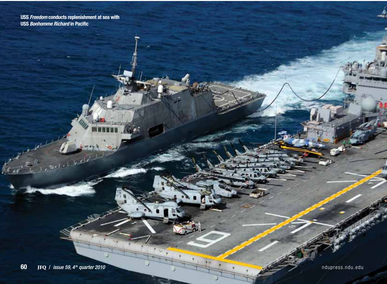
USS Freedom conducts replenishment at sea with USS Bonhomme Richard in Pacific