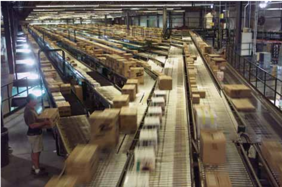
Concept of self-synchronization is adapted from Walmart method of near-real-time inventory replacement

(a gerund). They carried Metcalfe's law even further by asserting that the power of transactions carried on a network increases with the square of the number of users of the network. 42 However, the law does not describe the gains obtained from network-enabled military interactions. In fact, the benefits of military networking have upper limits; the