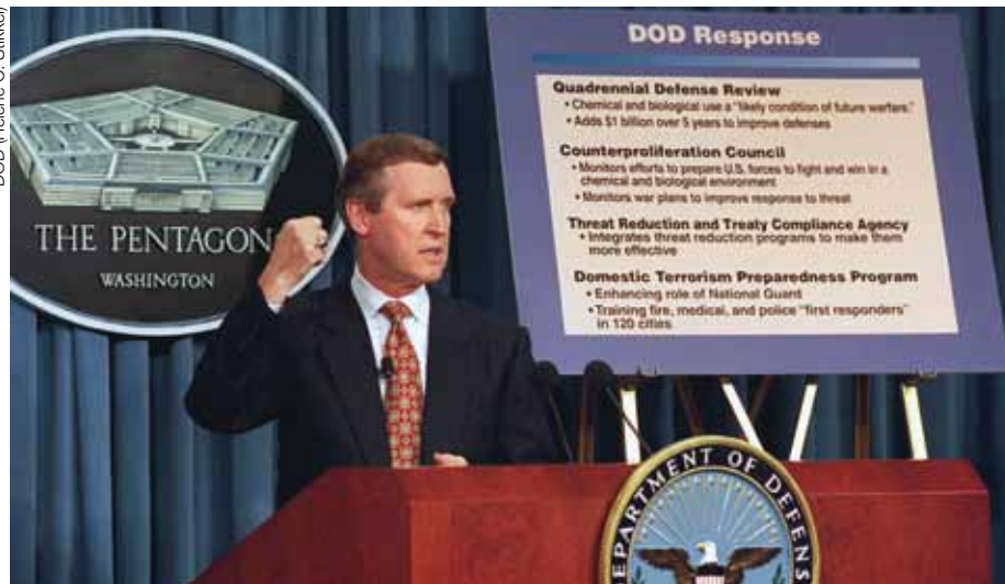
Secretary William Cohen emphasized worldwide threat of nuclear, biological, and chemical weapons during press briefing, 1997

In the late 1990s, Secretary of Defense William Cohen directed the Pentagon to take advantage of the “revolution in business affairs” to improve efficiency and cut waste. The military adopted business fads such as total quality management and velocity management in logistics. These changes coincided with the increased influence of information warfare enthusiasts who argued that the practices of the so-called new economy could be applied to waging war. 2 Some prominent military officials apparently were influenced by Alvin and Heidi Toffler’s 1993 book War and Anti-War: Survival at the Dawn of the 21 st Century . The central theme of the Tofflers’ work was that “the way we make war reflects the way we make wealth; and the way we make anti-war must reflect the way we make war.” 3 They claimed that a revolutionary “new economy” was arising based on knowledge