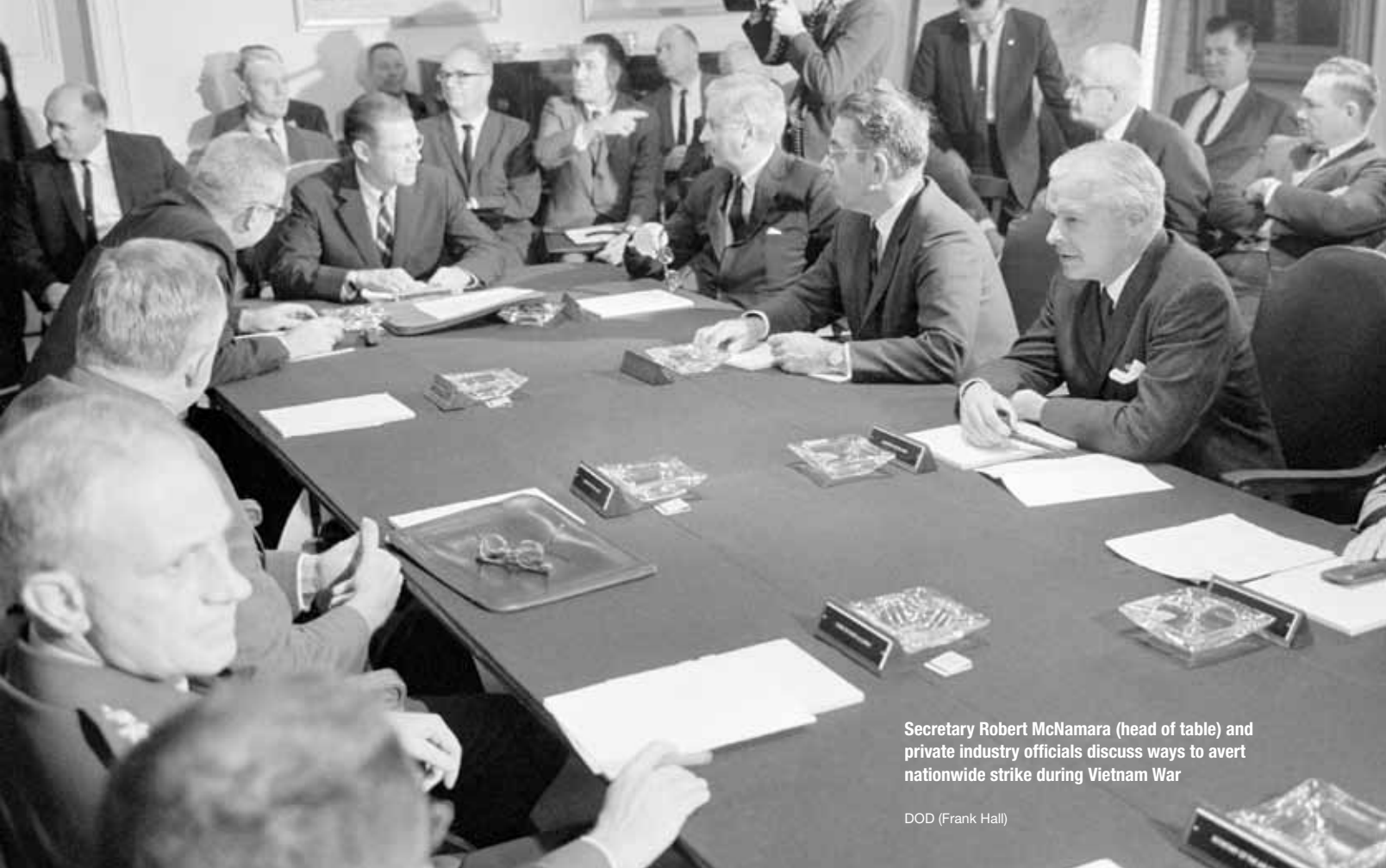
Secretary Robert McNamara (head of table) and private industry officials discuss ways to avert nationwide strike during Vietnam War