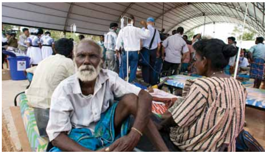
Internally displaced Sri Lankans receive medical treatment at camp clinic

Nations and other development agencies caved to the government's demands. 26 Economic losses and the devastation of Tamil areas affected popular will to continue the struggle and support the LTTE.