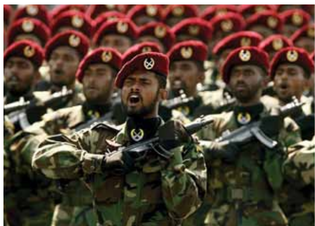
Sri Lankan soldiers rehearse for Independence Day celebration

remittances. In an extremely short period, the LTTE lost almost all financial support from expatriates in the West, at a time when the government was growing stronger even as the LTTE organization was under great stress on numerous fronts.