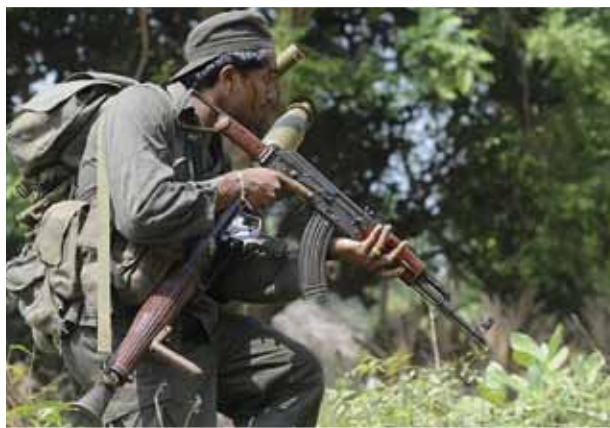
Sri Lanka army commando

many population centers from rebel control. Prabhakaran was unable to stymie the assault into the LTTE heartland by government forces, who killed him in March 2009. The rebels, isolated and forced into a tiny corner of the island, were broken by a final government offensive. An LTTE representative conceded defeat on May 17, 2009, ending 26 years of open conflict. 10