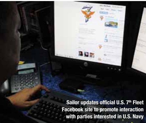
Sailor updates official U.S. 7 th Fleet Facebook site to promote interaction with parties interested in U.S. Navy