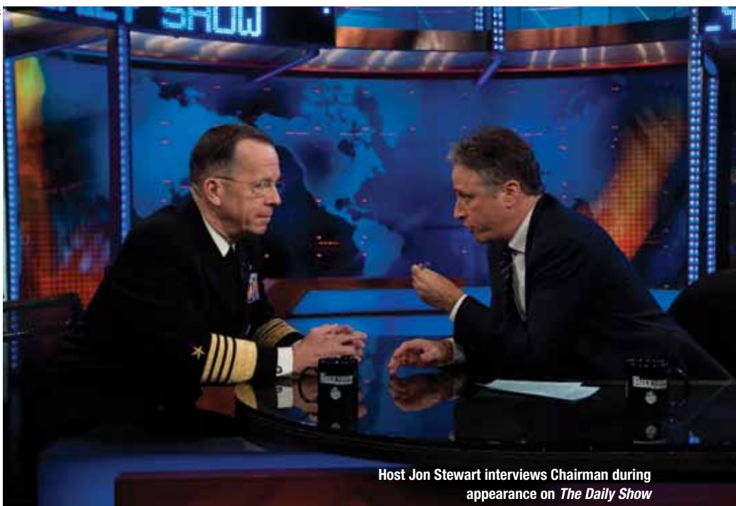
Host Jon Stewart interviews Chairman during appearance on The Daily Show

evolve—even significantly—but the media conversation does not end. Nine years after al Qaeda succeeded in projecting its message loud and clear to a global prime-time audience, the organization's media operatives are still very much engaged in a never-ending strategic communication effort with a worldwide network of sympathetic amateur prosumers who interpret, repurpose, and in some form or fashion proliferate the organization's messages.