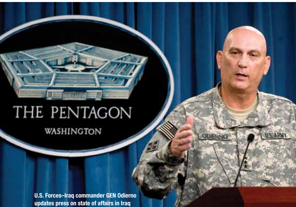
U.S. Forces–Iraq commander GEN Odierno updates press on state of affairs in Iraq