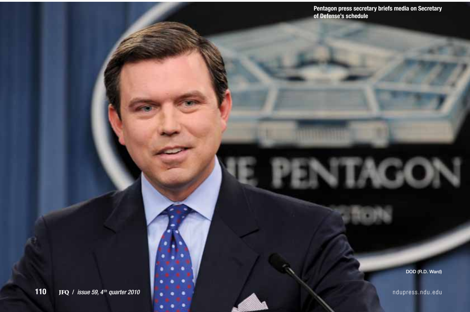
Pentagon press secretary briefs media on Secretary of Defense's schedule

Successful strategic communication in the new media sphere cannot remain the exclusive domain of professional strategic communicators insulated from most aspects of mission execution. To compete for attention with the proliferation of messages exchanged