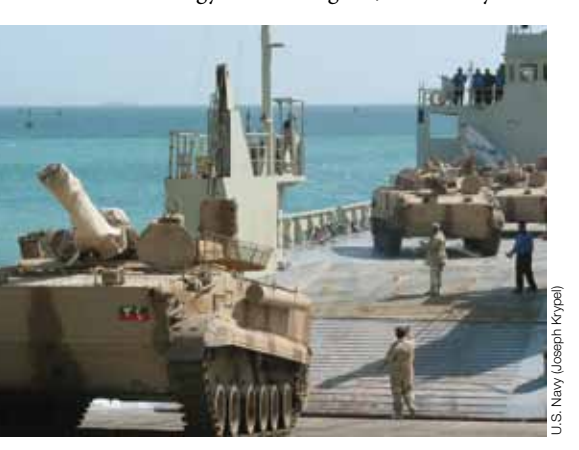
BMP-3 armored personnel carrier offloaded in Kuwait as part of Gulf Cooperation Council protective buildup, March 2003

To ensure that they could hold Iranian targets at risk, Arab Gulf states are likely to be interested in acquiring and modernizing their now limited ballistic missile holdings. The Saudis clandestinely procured intermediaterange CSS-2 ballistic missiles from China in the mid-1980s, and the UAE clandestinely procured Scud missiles from China in 1989. These missiles are old, though, and the UAE and Saudi Arabia would no doubt like more ballistic missiles. Pakistan, China, North Korea, and Russia would be the places for them to shop, and they could offer lucrative sales to countries willing to skirt the Missile Technology Control Regime, a voluntary