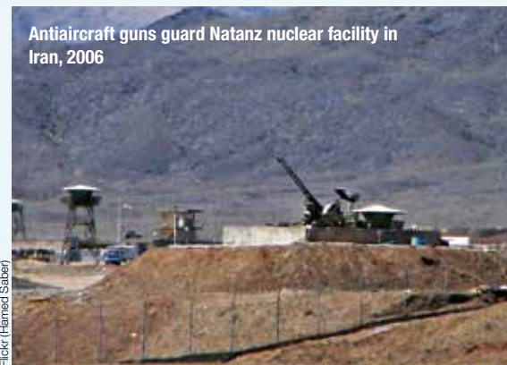
Anti-aircraft guns guard Natanz nuclear facility in Iran, 2006

umbrella to deter Iranian aggression, but that suggestion is likely to be less than satisfactory to the Turkish military. Turkey remembers well that when it prudently turned to NATO for protection from potential Iraqi retaliation in the run-up to the American-British 2003 war against Iraq, Turkey was sternly rebuffed. That experience was a bitter pill to swallow and will argue in favor of a nuclear deterrent against Iran's nuclear stockpile.