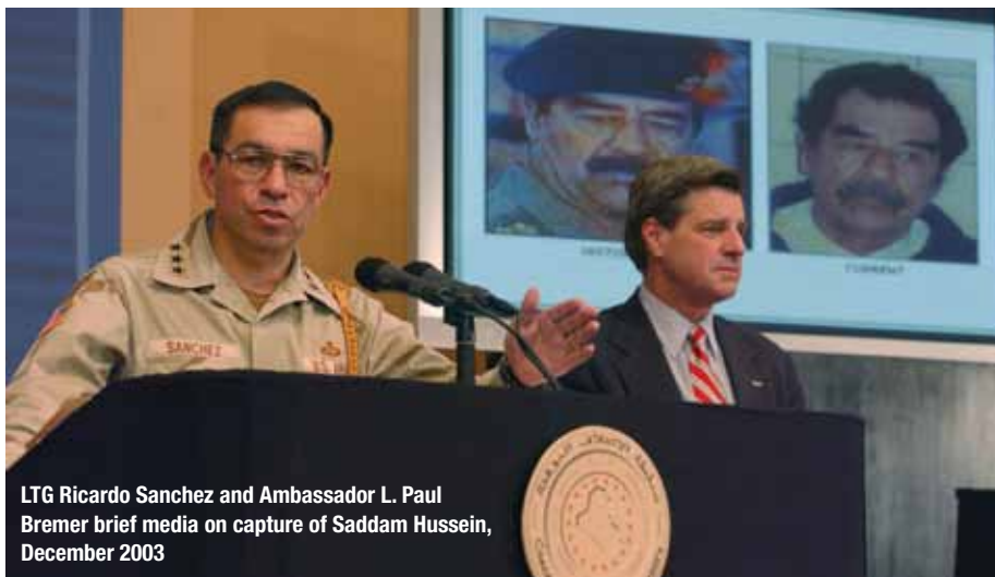
LTG Ricardo Sanchez and Ambassador L. Paul Bremer brief media on capture of Saddam Hussein, December 2003

A factor that looms large behind Middle Eastern aspirations for nuclear weapons is power and influence—beyond nuclear and conventional deterrence and warfighting capabilities—in regional and international politics. The Iranians would want to parlay a nuclear weapons inventory to politically coerce Saudi Arabia and the