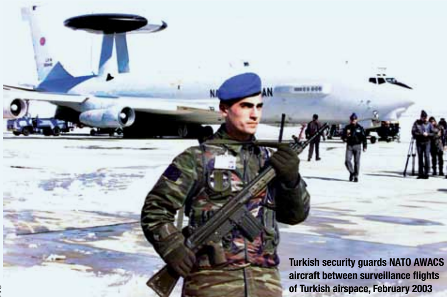
Turkish security guards NATO AWACS aircraft between surveillance flights of Turkish airspace, February 2003

ties to the region is dangerously short-sighted. These capabilities could well be converted for military nuclear weapons programs in some shape or form in the next generation.