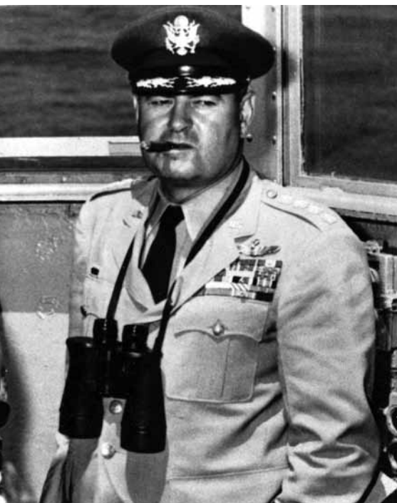
U.S. Air Force

can make or break an individual's will when facing seemingly impossible circumstances. 40 While it is a trait found in abundance, it is not one that is learned. As one author notes, "The data suggest that Americans attracted to attend a service academy display a set of values consistent with U.S. military doctrine." 41 Just how far this study can be generalized across the Services is unknown, but the demands of military life and work are likely to cause a strong self-selection bias toward hardy individuals.