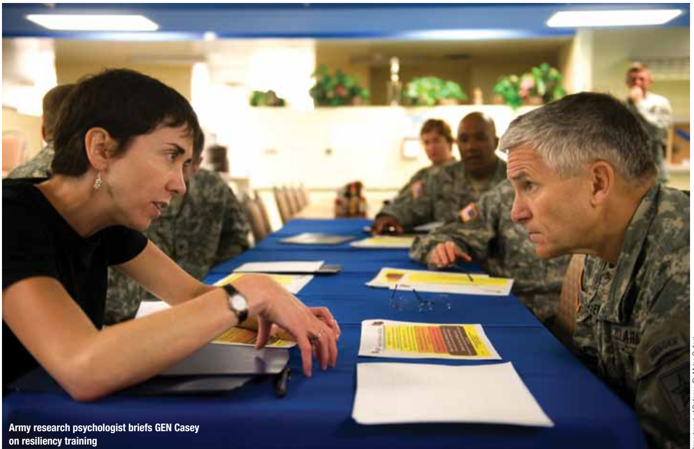
Army research psychologist briefs GEN Casey on resiliency training