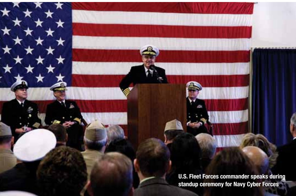
U.S. Fleet Forces commander speaks during standup ceremony for Navy Cyber Forces

The United States has not achieved dominance in the cyberspace domain. We intuitively understand that we dominate all warfighting domains except cyber—and our national economy, livelihood, civilization, and culture are as dependent on it as our military. Cyberspace is the only domain without a primary Service as lead and the only domain in which DOD will not defend the U.S. homeland. 12 For example, if DOD defended the land domain in the same manner as cyberspace, a Russian land (amphibious/airborne) invasion of New Jersey would have to be fought by U.S. citizens and commercial entities with whatever weapons they happened to possess. DOD would only defend Fort Monmouth and Fort Dix.