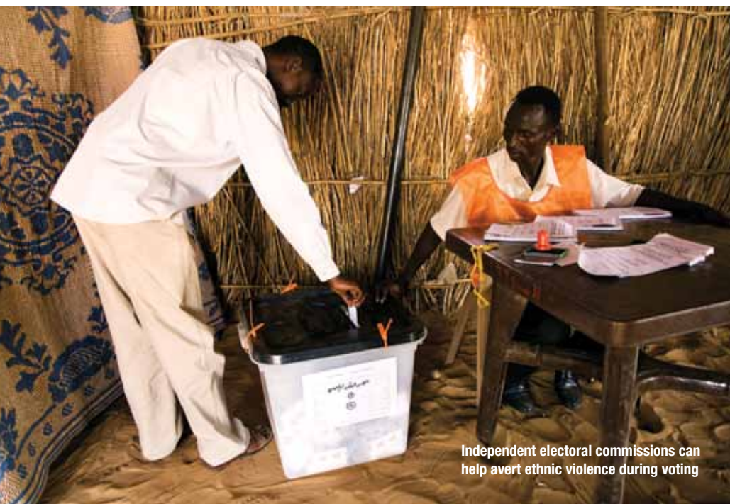
Independent electoral commissions can help avert ethnic violence during voting

Periodic eruptions of violence involving Christians and Muslims in Nigeria's highly diverse "middle-belt" Plateau State capital, Jos, are a case in point. This violence is usually reported as "communal conflict." This characterization, however, overlooks some of the institutional arrangements of Nigeria's federal system that foster this violence. State and local governments have enormous influence in this system, controlling roughly 80 percent of the