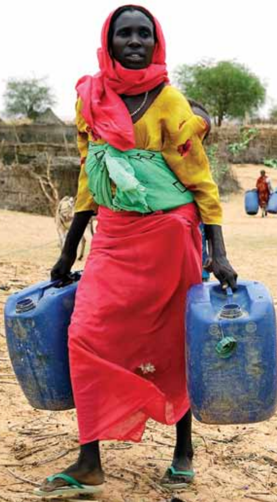
Woman walks to water distribution site set up by African Union and United Nations Mission in Darfur