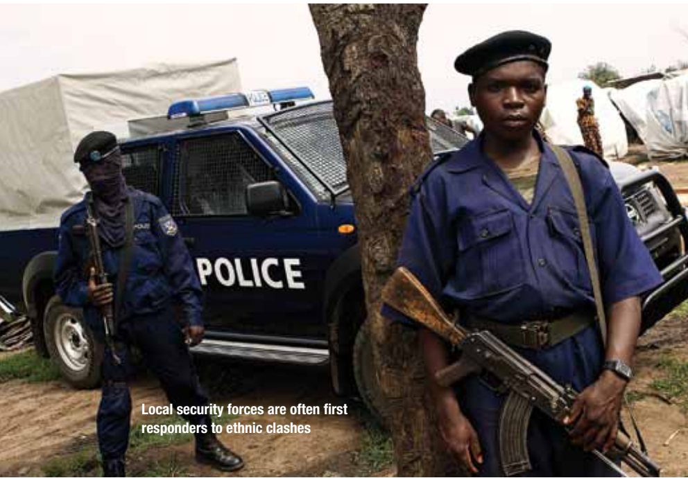
Local security forces are often first responders to ethnic clashes