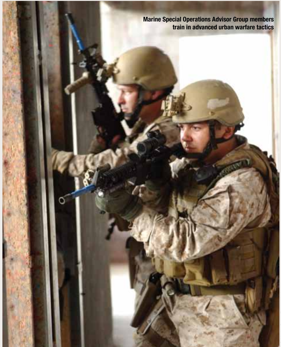
Marine Special Operations Advisor Group members train in advanced urban warfare tactics

top priority for us is the preparation, deployment, and redeployment of our forces to and from combat, specifically in support of Operation Enduring Freedom-Afghanistan . This includes developing the special operations task force and preparing for its employment as well as maintaining the two-company presence. We are also focused on building partnerships with other partner nations'