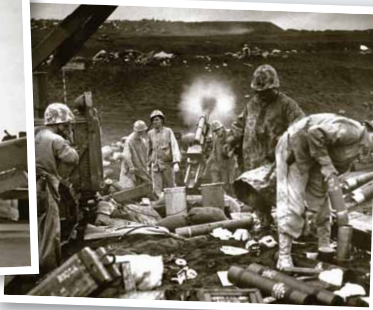
U.S. Marine Corps