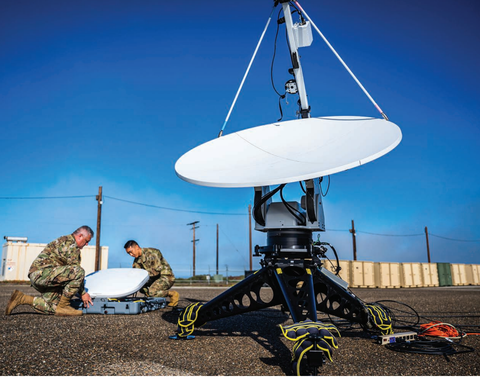
Two members of 216<sup>th</sup> Space Control Squadron set up antennas as part of "Honey Badger System" during Black Skies 22, designed to rehearse command and control of multiple joint electronic warfare fires, at Vandenberg Space Force Base, California, September 20, 2022

consideration of these systems. As in assessment of friendly and adversary systems, space planners use the space MCOO layers to complete this step, focusing on neutral space systems that affect the OE. This assessment is led by space operations personnel with expertise from each space mission area.