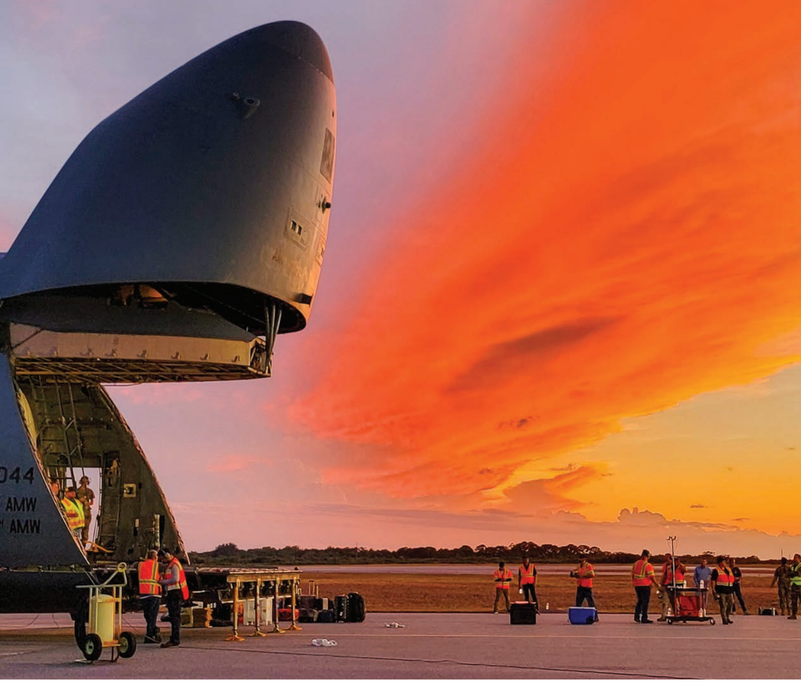
Loadmasters from 60<sup>th</sup> Air Mobility Wing and Lockheed Martin Space unload sixth Geosynchronous Earth Orbit Space Based Infrared System satellite from C-5M Super Galaxy, at Cape Canaveral Space Force Station, Florida, June 2, 2022

the knowledge necessary for development of courses of action and informed decisionmaking by the commander. The figure, derived from Figure III-5 in Joint Publication 5-0, Joint Planning , outlines those inputs and outputs.