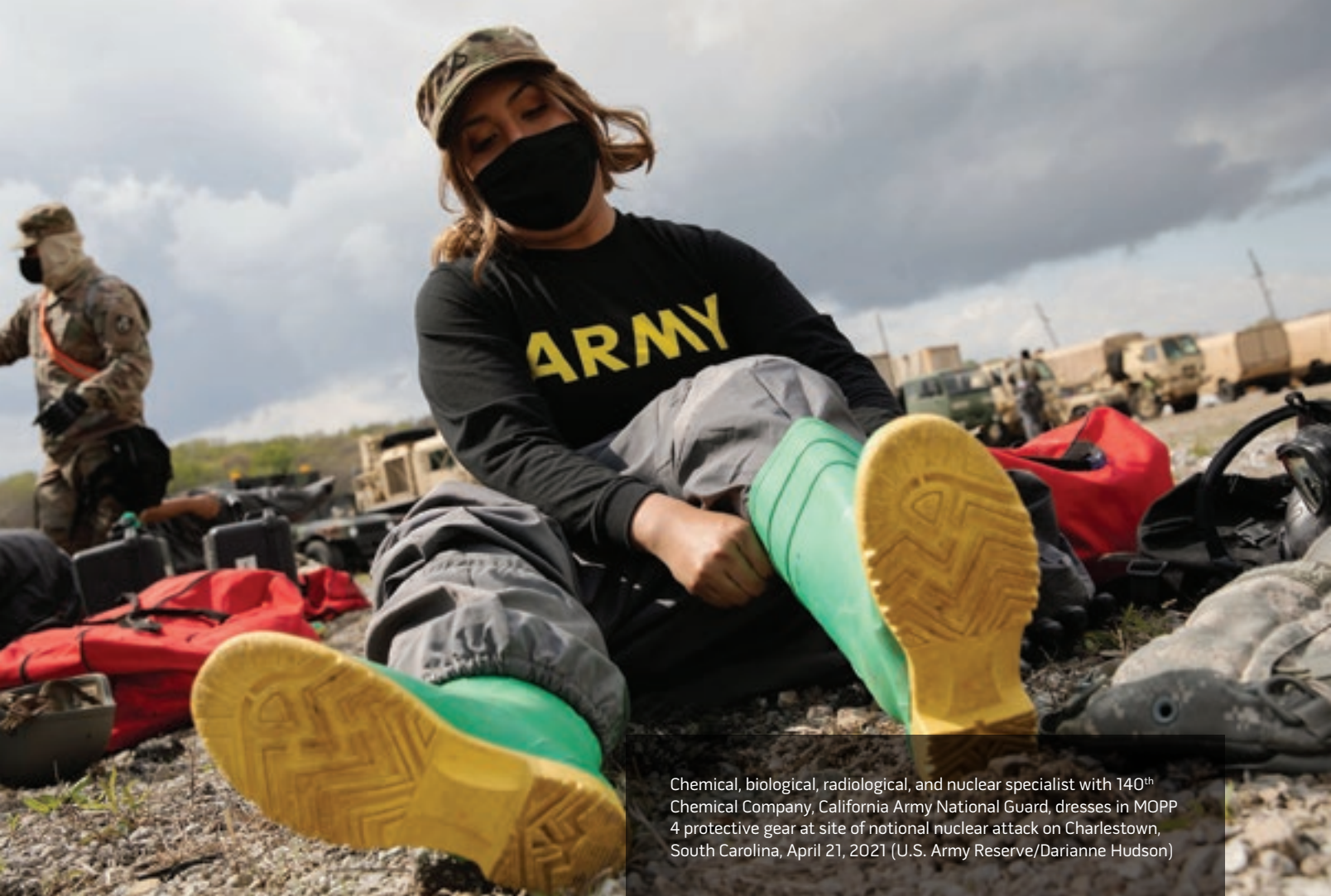
Chemical, biological, radiological, and nuclear specialist with 140 th Chemical Company, California Army National Guard, dresses in MOPP 4 protective gear at site of notional nuclear attack on Charlestown, South Carolina, April 21, 2021