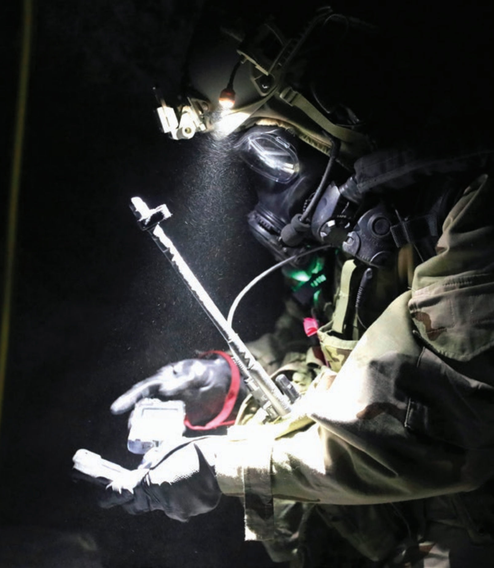
Soldier assigned to 56 th Chemical Reconnaissance Detachment clears laboratory suspected of housing components for chemical weapons during training exercise in Utah, January 31, 2022