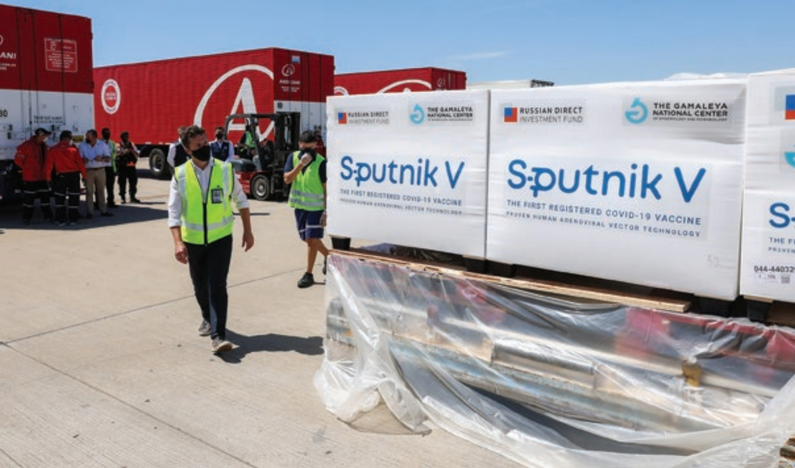
Arrival of first batch of Sputnik V vaccines to Argentina, December 24, 2020