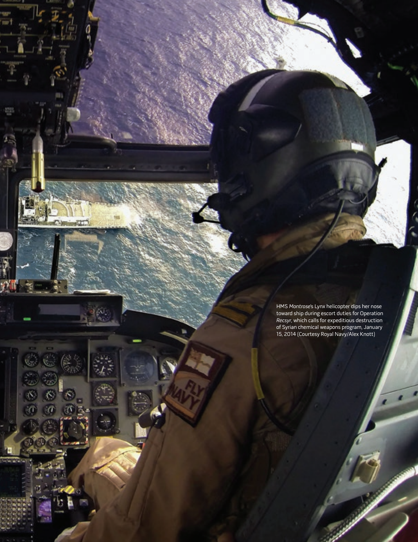
HMS Montrose 's Lynx helicopter dips her nose toward ship during escort duties for Operation Recsyr , which calls for expeditious destruction of Syrian chemical weapons program, January 15, 2014