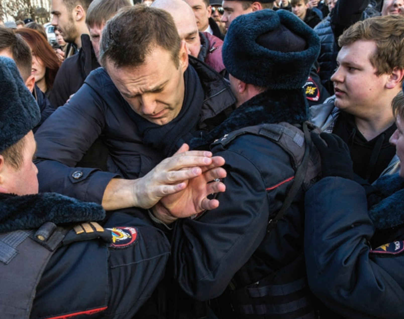
Russian authorities detain opposition leader Alexey Navalny on Tverskaya Street in Moscow, March 26, 2017

delegations of U.S. health officials traveled to the Soviet Union to discuss the resumption of official joint committee meetings to expand government health exchanges. At the first such meeting, in 1987, the United States warned it would end all AIDS research collaboration with the Soviets unless the disinformation campaign stopped. 41 Today, Russia continues to use false allegations about biological weapons development to sow distrust and weaken biological disarmament norms, as has become ever more apparent in its recent charges levied about Ukrainian laboratories. 42 In a context of increased insecurity in Europe, the White House and the Global Engagement Center at the State