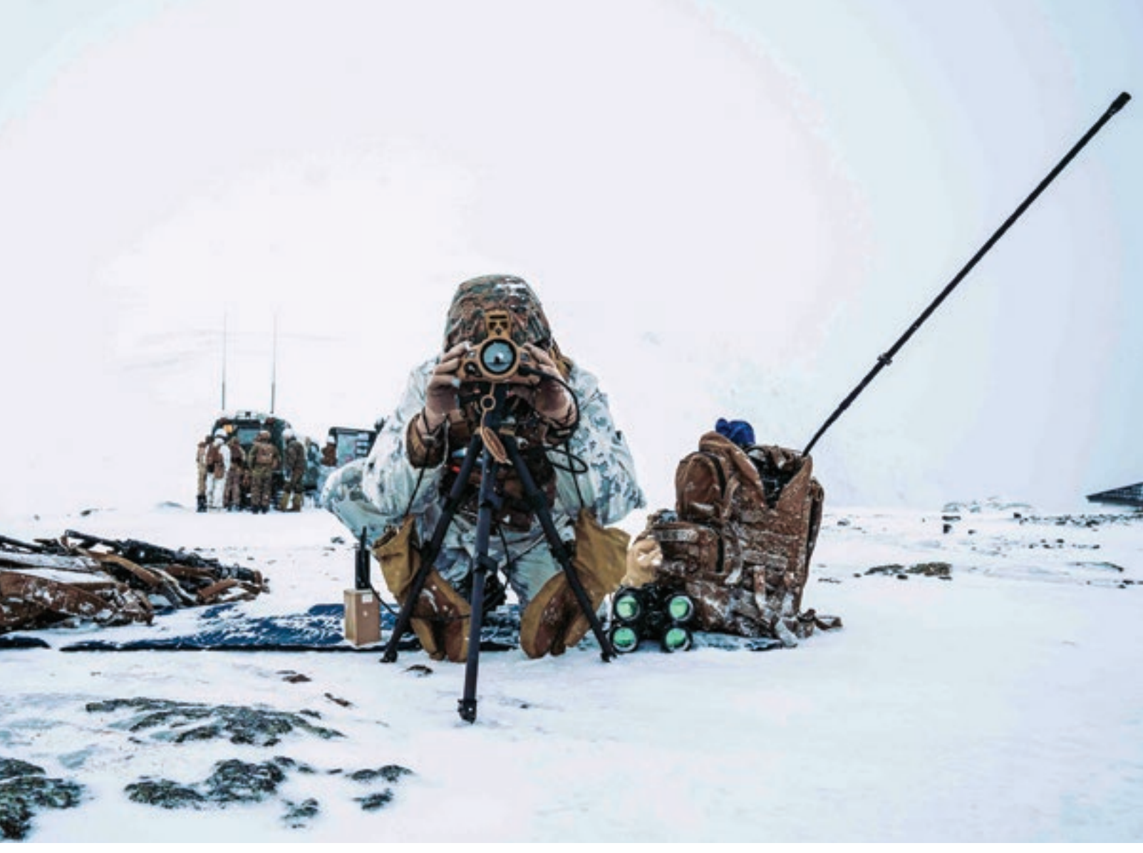
Marine attached to 3<sup>rd</sup> Battalion, 6<sup>th</sup> Marine Regiment, 2<sup>nd</sup> Marine Division, scans for targets for Fire Support Coordination exercise prior to exercise Cold Response 22, in Setermoen, Norway, March 7, 2022

exist at conflict termination due to war's elements of uncertainty and chance.<sup>44</sup> Maintaining focus on interagency-military transitions in doctrine reminds planners to account for the inevitable transitions of responsibility.