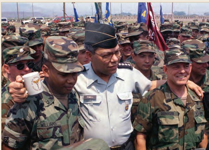
General Powell with Soldiers from Joint Task Force B during exercise Fuertes Caminos '91 , in Honduras, April 1, 1991