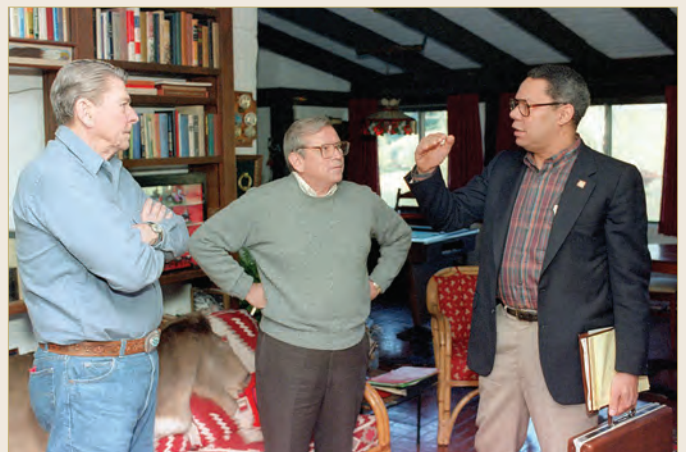
President Ronald Reagan, Chief of Staff Howard Baker, and newly appointed National Security Advisor Powell confer inside Rancho Del Cielo, in California, on November 25, 1987