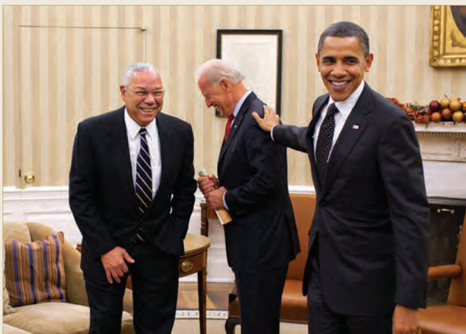
President Barack Obama jokes with Vice President Joe Biden and former Secretary of State Powell following their meeting in Oval Office, December 1, 2010