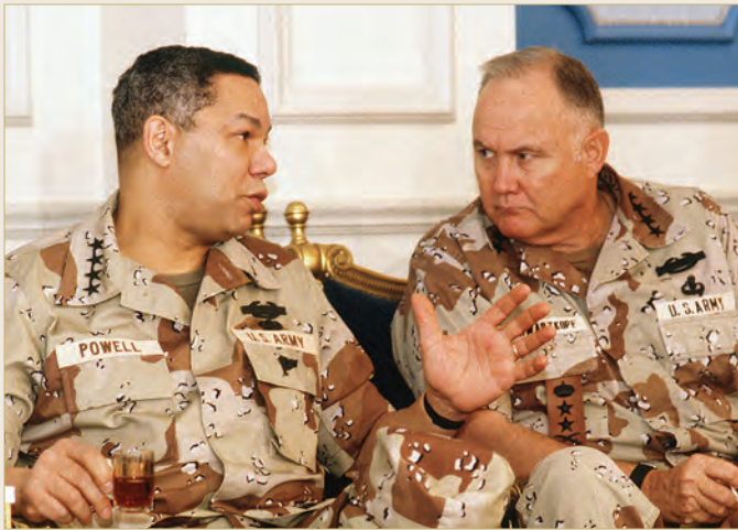
General Powell and General Norman H. Schwarzkopf, commander-in-chief, U.S. Central Command, discuss coalition activities during Operation Desert Shield