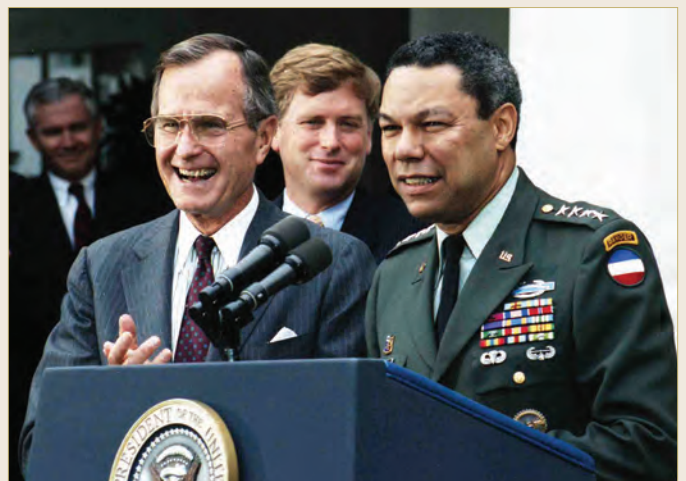
President George H.W. Bush announces selection of General Powell as Chairman of the Joint Chiefs of Staff, August 10, 1989