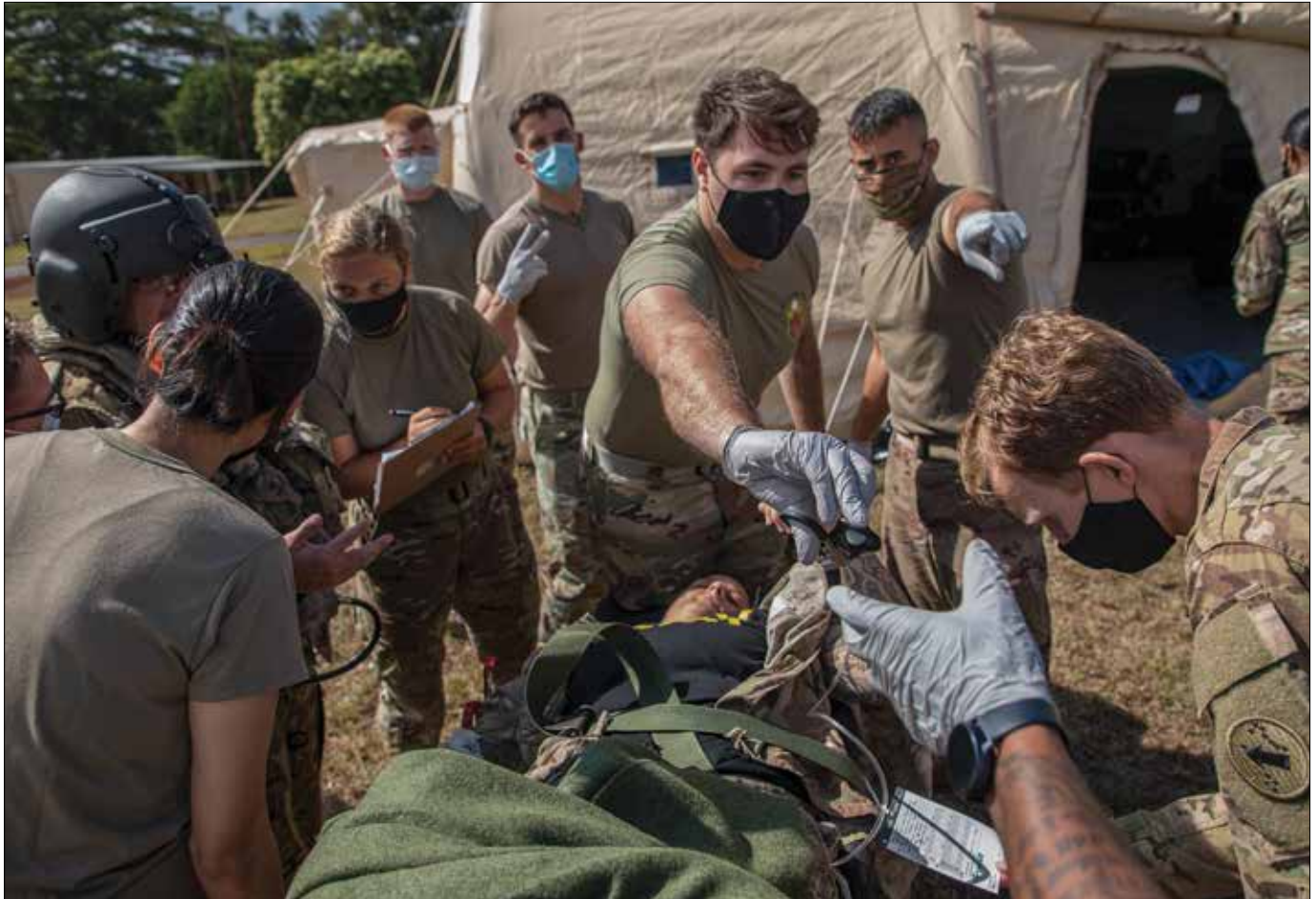
“Dustoff” pilots and flight crew from 3 rd Battalion, 25 th Aviation Regiment, 25 th Combat Aviation Brigade, train on air-to-ground patient transfers and reporting requirements during multiship joint training with Tripler Army Medical Center and 8 th Forward Surgical Team, enhancing medical treatment skills on Oahu, Hawaii, August 8, 2020

to better stabilize regional threats. 4 However, GHE efforts in the setting of a legacy MEDRETE are held in check by performance measures falsely perceived as training requirements—that is, seeing thousands of patients at a time. More concerted efforts to build partnerships or institutional capacities within the local health system are diminished. Formal or informal subject matter expert exchanges or bilateral educational seminars with host-nation counterparts are held on the side, if they are held at all, to prevent diverting attention and resources from high-patient volume legacy MEDRETEs.