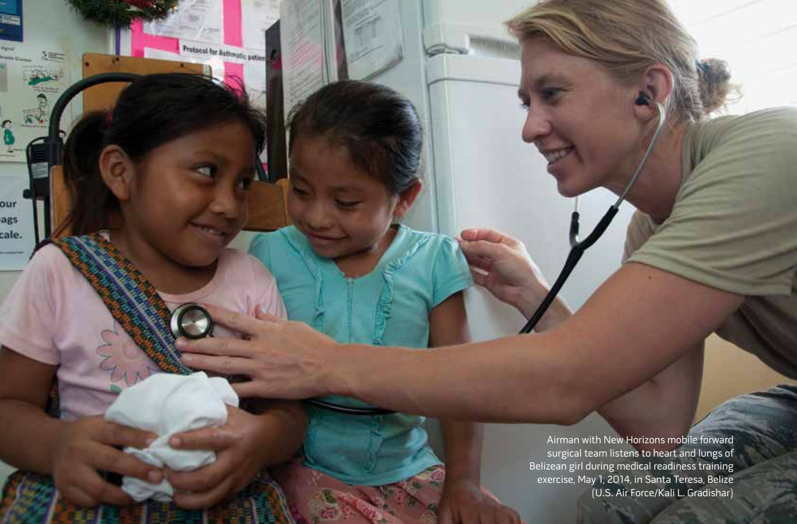
Airman with New Horizons mobile forward surgical team listens to heart and lungs of Belizean girl during medical readiness training exercise, May 1, 2014, in Santa Teresa, Belize