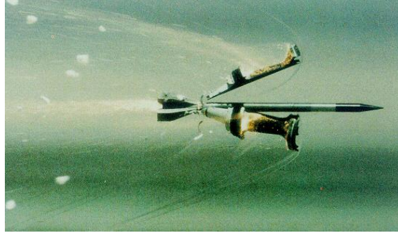
Figure 3: A representation of the final stage of sabot separation from the penetrator. 59

Arsenal and BRL also produced a series of designs for the sabot focusing on exact shape of the scoops or ramps. The final double ramp sabot shape used on the M829 was the result of computer modeling by BRL. 60