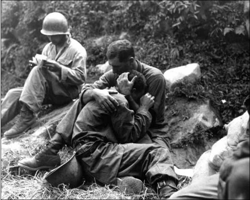
A grief-stricken American infantryman whose buddy has been killed in action is comforted by another Soldier. In the background, a corpsman methodically fills out casualty tags, Haktong-ni area, Korea, August 28, 1950