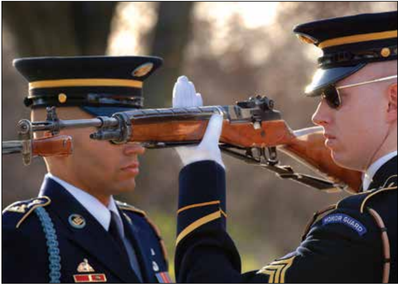
A member of the 3 rd U.S. Infantry, The Old Guard, inspects a relieving guard's rifle before his watch at the Tomb of the Unknown Soldier, Arlington National Cemetery, January 9, 2008