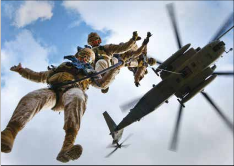
Marine Heavy Helicopter Squadron 464 assists Marines of 2 nd Reconnaissance Battalion conduct special purpose insertion and extraction training aboard Marine Corps Base Camp Lejeune, North Carolina, March 13, 2013