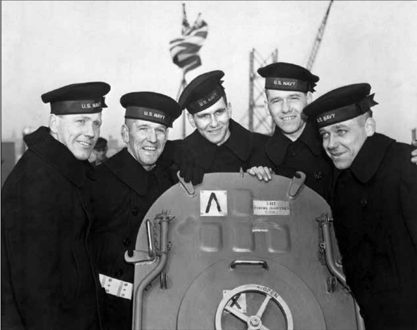
The Sullivan brothers were five siblings all killed in action during or shortly after the sinking of the light cruiser USS Juneau (CL-52), the vessel on which they all served, around November 13, 1942, in World War II