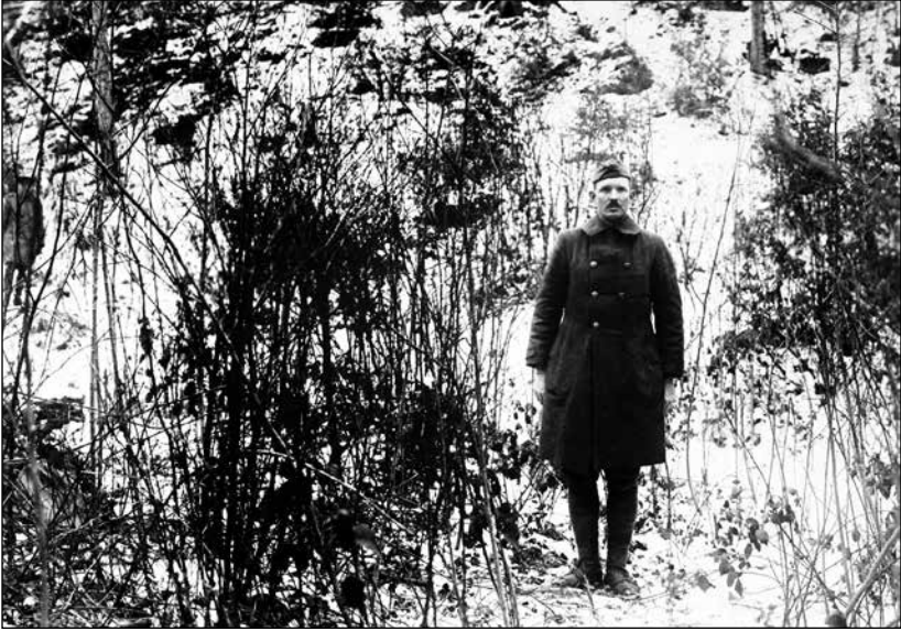
Sergeant Alvin C. York, 328 th Infantry, who with the aid of 7 men captured 132 German prisoners, shows the hill on which the raid took place on October 8, 1918, in the Argonne Forest, near Cornay, France, after World War I