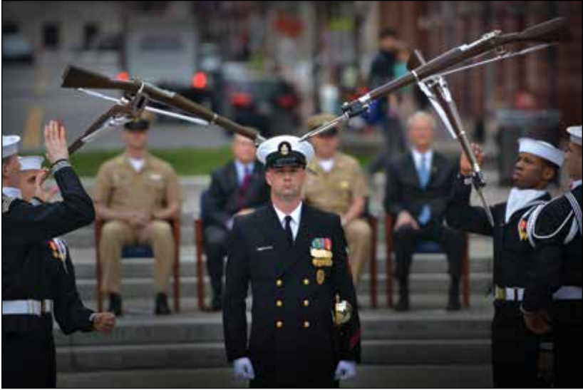
Navy chief petty officers celebrate 120 years of the chief petty officer rank, April 1, 2013, at the U.S. Navy Memorial in Washington, DC