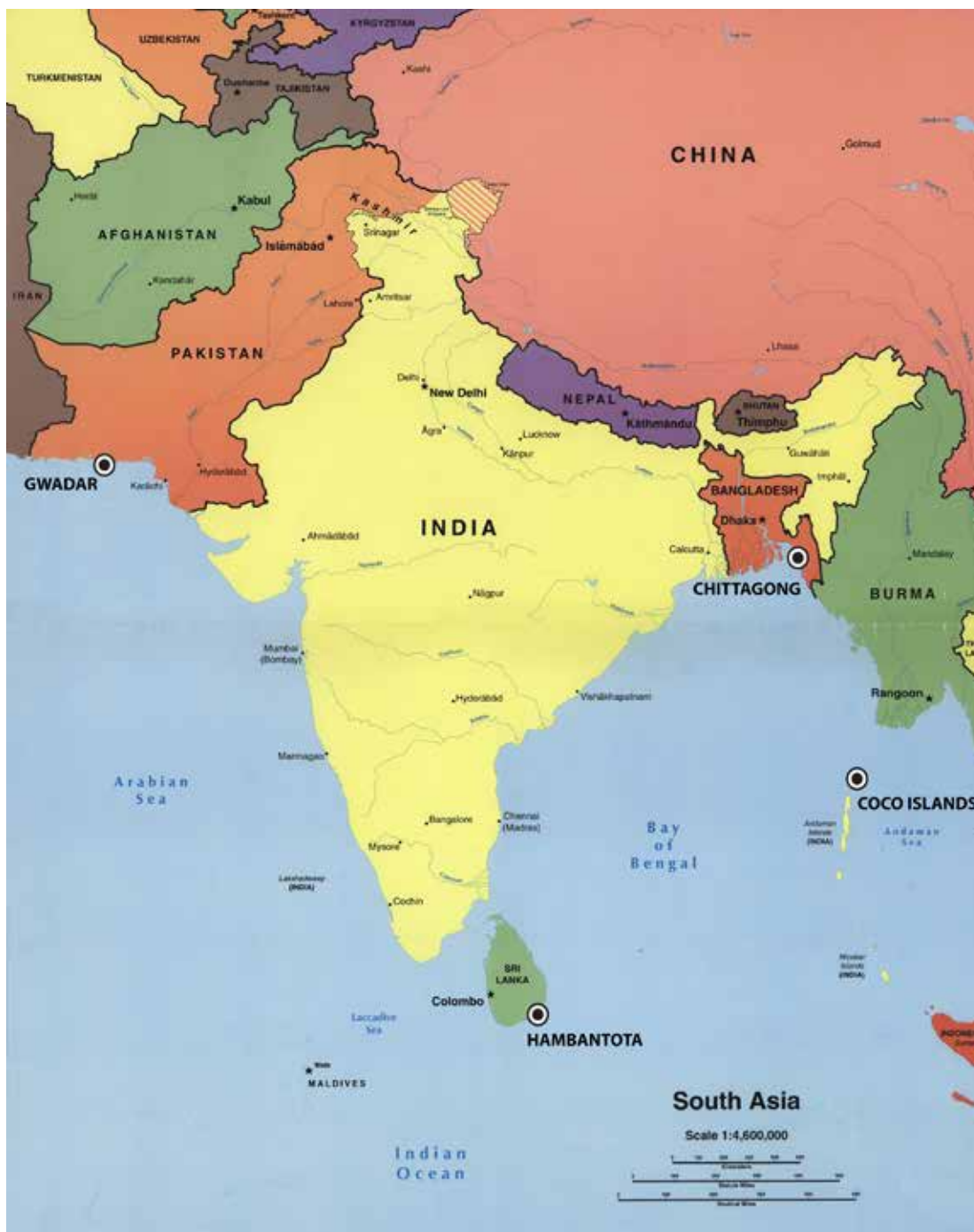
Figure 2. “String of Pearls” Sites