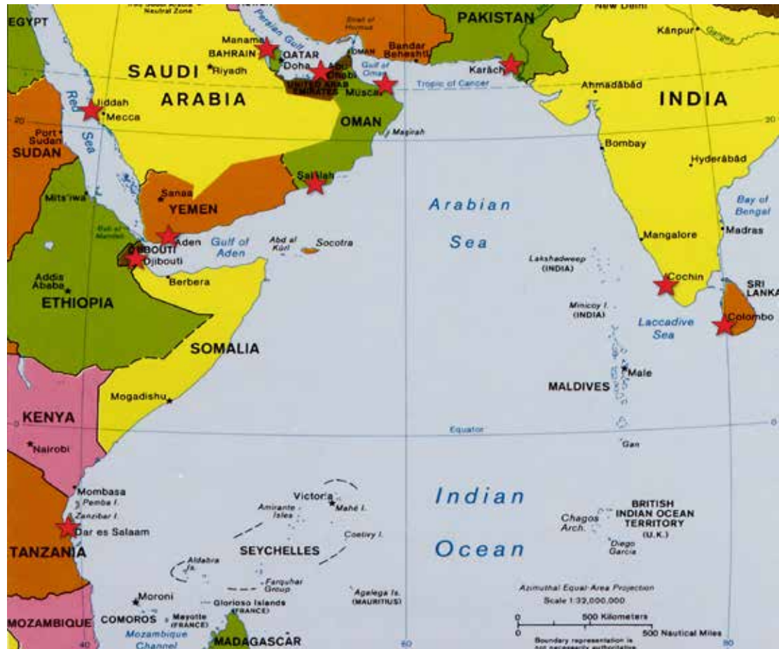
Figure 1. PLA Navy Ports of Call in Support of the Gulf of Aden Counterpiracy Task Force

PLAN prefers to replenish its ships and rests its crews but also of where it is likely to develop formal arrangements should it choose to do so.” 81 In contrast to the claims of String of Pearls advocates, the current Chinese overseas access network does not overlap with “pearl” candidate sites at all. Instead, the PLAN has operated out of ports such as Salalah, Aden, Djibouti, and Karachi.