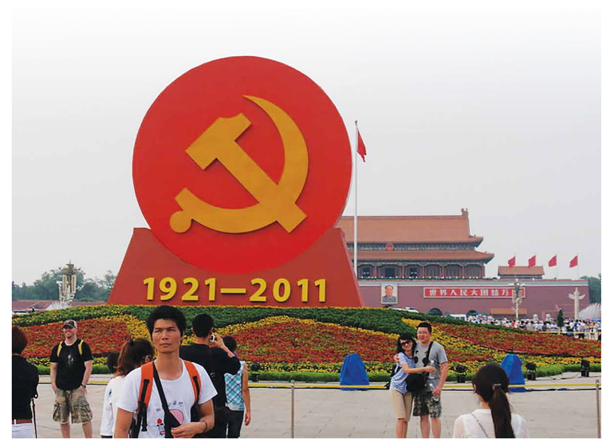
A large temporary monument in Tiananmen Square marking the 90th anniversary of the Chinese Communist Party.