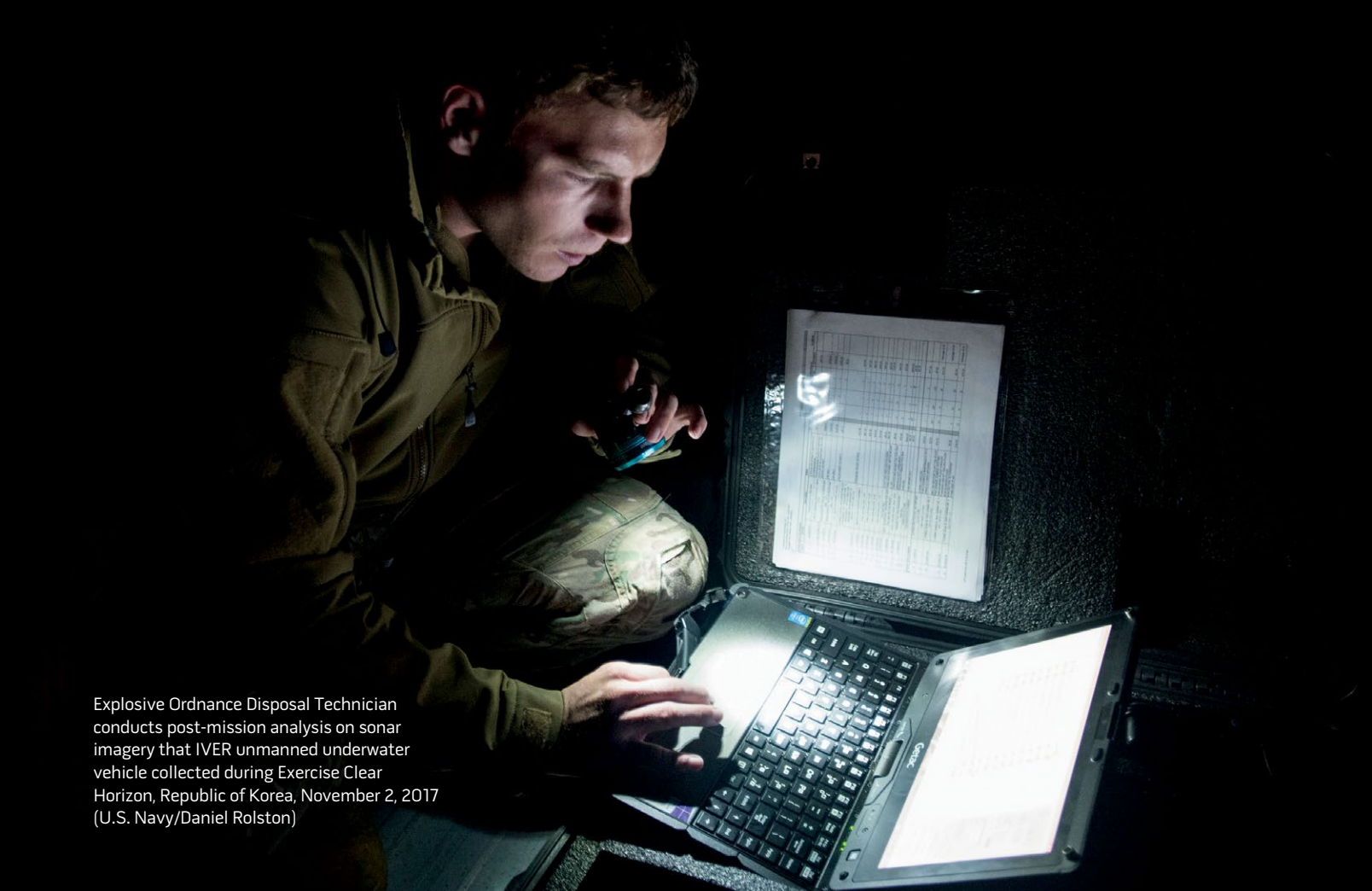
Explosive Ordnance Disposal Technician conducts post-mission analysis on sonar imagery that IVER unmanned underwater vehicle collected during Exercise Clear Horizon, Republic of Korea, November 2, 2017