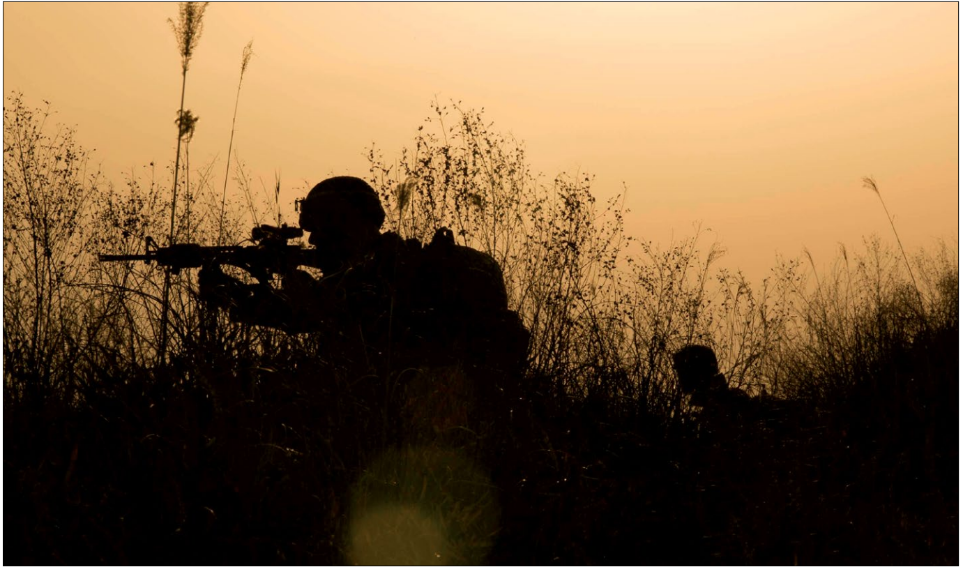
Marines with 3 rd Marine Division, III Marine Expeditionary Force, post security on patrol during Forest Light 15-1, at the Oyanohara Training Area in Yamato, Kumamoto prefecture, Japan, December 9, 2017

In the step Comparison of Friendly Options, the focus should be exclusively on evaluating advantages and disadvantages of each friendly option. Identified disadvantages must be remedied and thereby improve the chances of success of individual friendly options. Each friendly option should be then tested for feasibility and acceptability. After weighing the relative merits of each friendly option, the commander should select the best and second-best friendly options. Afterward, these should be converted into the best and second-best courses of action.