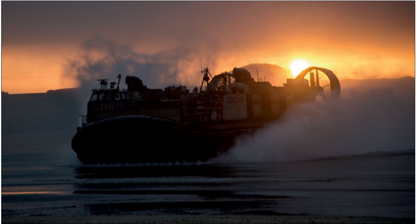
Landing craft air cushion vehicle lands on beach, in tandem with Australian counterparts, as part of large-scale amphibious assault during Talisman Saber 17, Townshend Island, Australia, July 13, 2017

for the favored air COA. Also, the JFC has to discuss relative advantages and disadvantages of the alternative air COAs in case this could assist the JFC in reaching a decision. 69