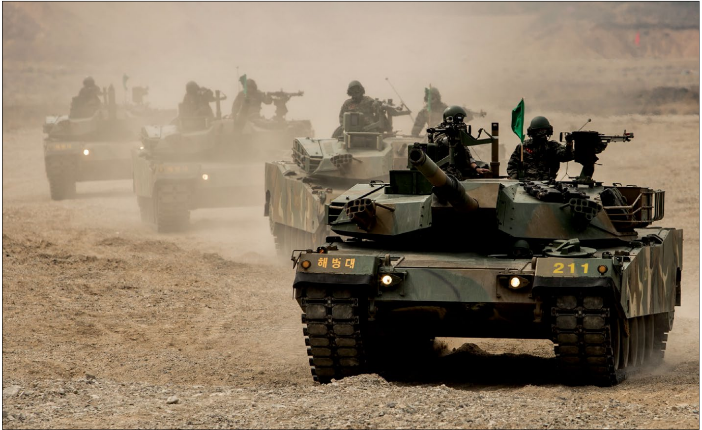
Republic of Korea tanks with 1 st Tank Battalion, 1 st Marine Division, head off firing line in formation during Korea Marine Exercise Program 17-6, at SuSong Ri Range, Pohang, Republic of Korea, March 23, 2017

command, the intent was more important than the mission. It was virtually sacrosanct. The intent provided a framework within which a subordinate commander could act in the spirit of the mission issued by the higher commander. 28