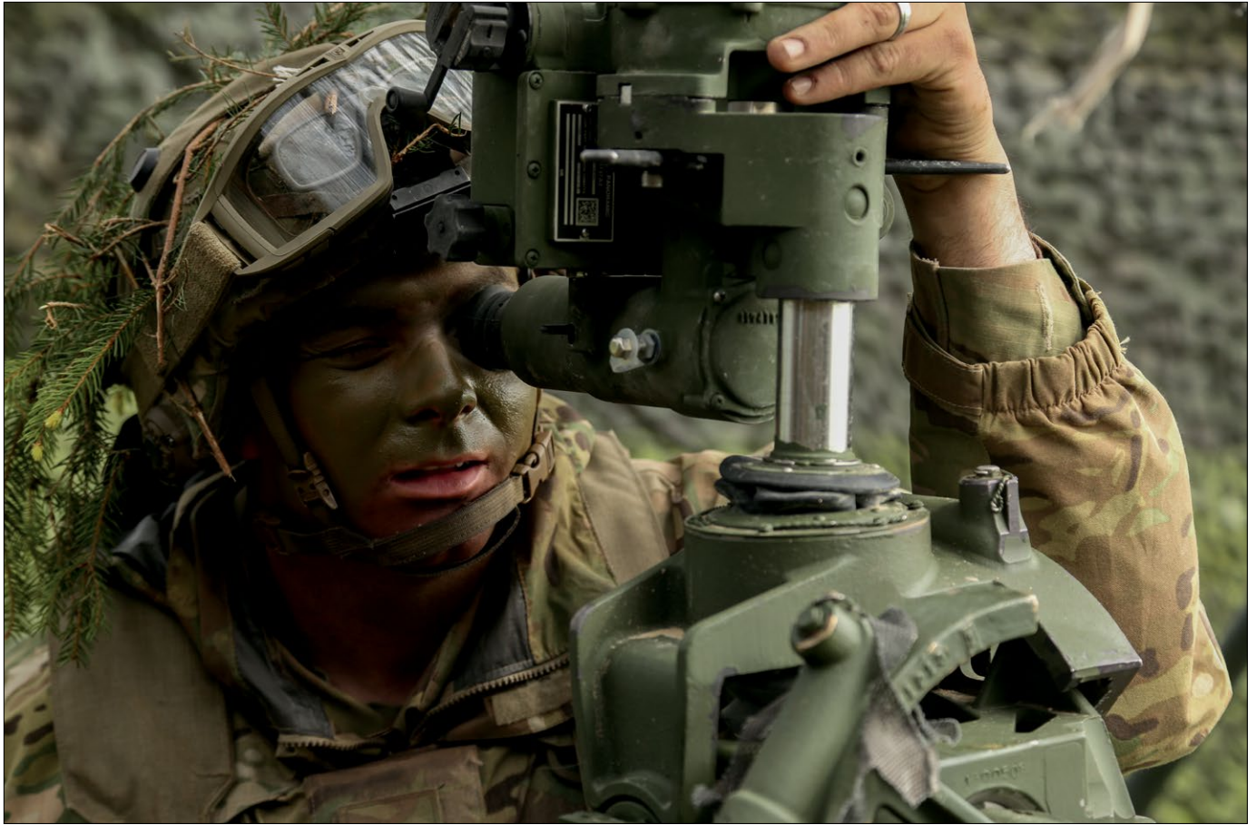
Soldier, assigned to 2 nd Cavalry Regiment, adjusts aim of M777 towed 155mm howitzer, while conducting simulated call for fire missions during Saber Junction 17, at Hohenfels Training Area, Germany, May 3, 2017

Planning , consists of many substeps, but not all are directly related to decision-making. For example, the Determining Critical Factors and a Friendly Center of Gravity substep properly belongs to the estimate of enemy situation; also, decisive points play a role in determining methods of how to defeat the enemy's center of gravity. Yet it is a stretch to include it in mission analysis. As in the case of the MDMP Handbook, mission analysis in NWP 5-01 includes a substep on initial risk assessment. 22