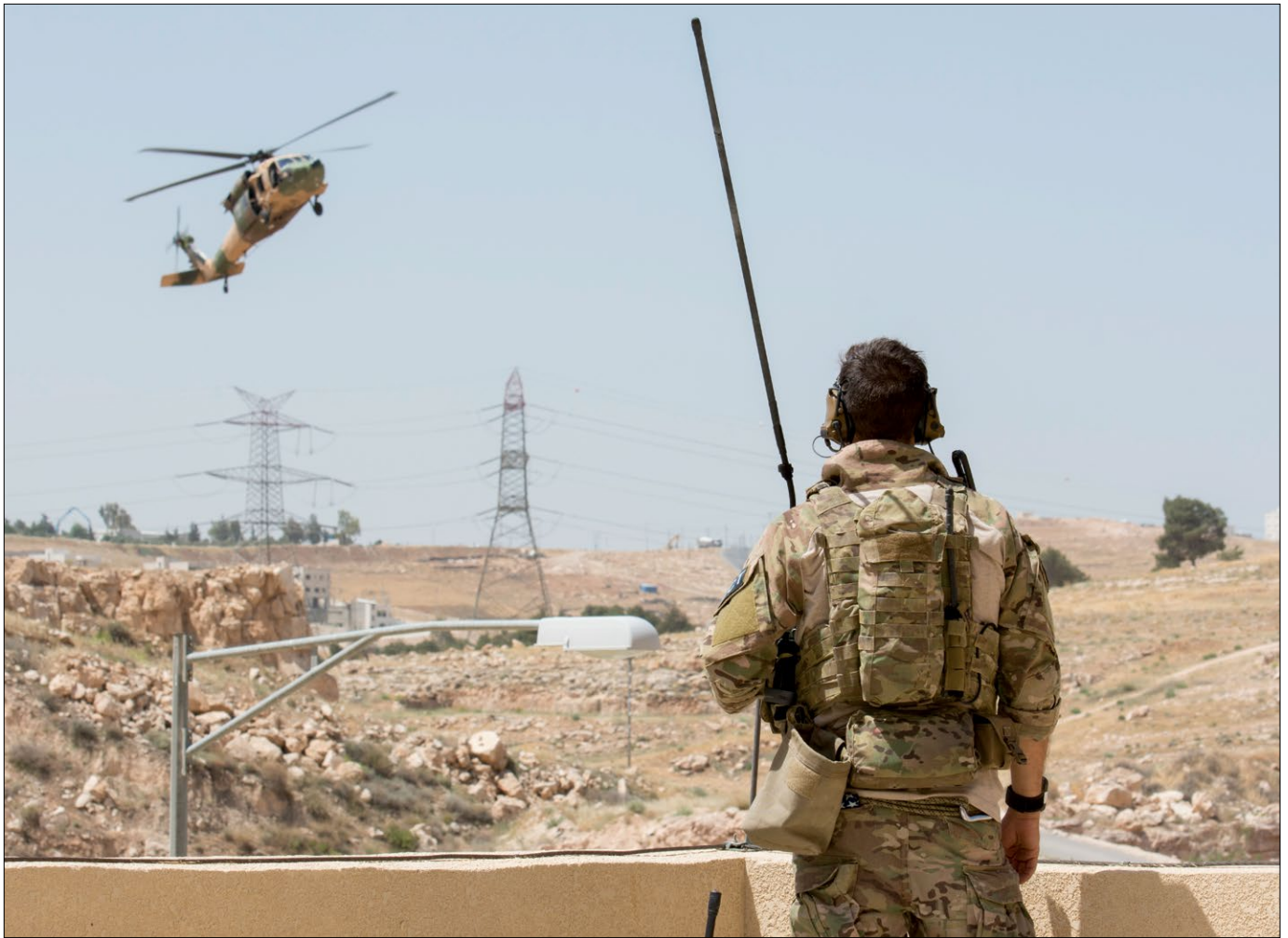
Air Force Combat Controller, part of 23 rd Special Tactics Squadron, watches Jordanian UH-60 helicopter approach during Eager Lion 2017, annual U.S. Central Command exercise, Amman, Jordan, May 11, 2017

methods in assessing the combat potential of both friendly and enemy forces (for example, relative combat potential, historical minimum planning ratios, and measures of effectiveness). 63 Yet there is a great danger in overemphasizing the importance of these methods. Any force includes a multitude of intangible elements, and they are difficult if not impossible to quantify in any meaningful way. The tactical commander should not allow mathematical computations to drive his analysis. 64 The commander and staff must fully consider human factors, such as the enemy's intentions, will to fight, morale, and discipline. 65 Despite many claims to the contrary, quantifiable methods are of limited usefulness. It is inherently difficult and uncertain to properly assess and anticipate the results of the highly dynamic interactions between