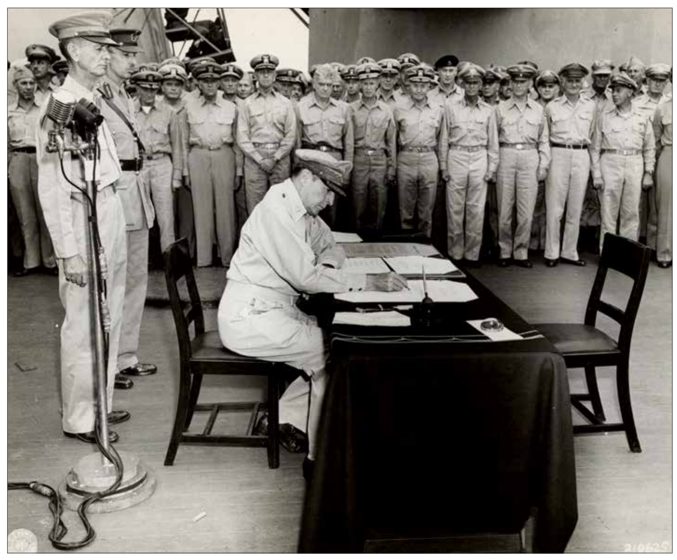
Supreme Allied Commander General Douglas MacArthur signs Instrument of Surrender on board USS Missouri , Tokyo Bay, September 2, 1945