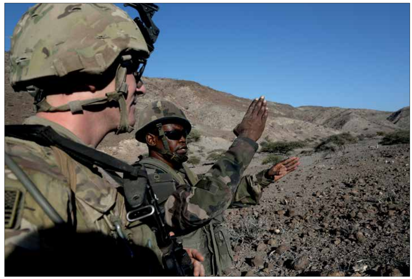
French soldier discusses objectives with U.S. Soldier during field training exercise in Arta, Djibouti, March 16, 2016