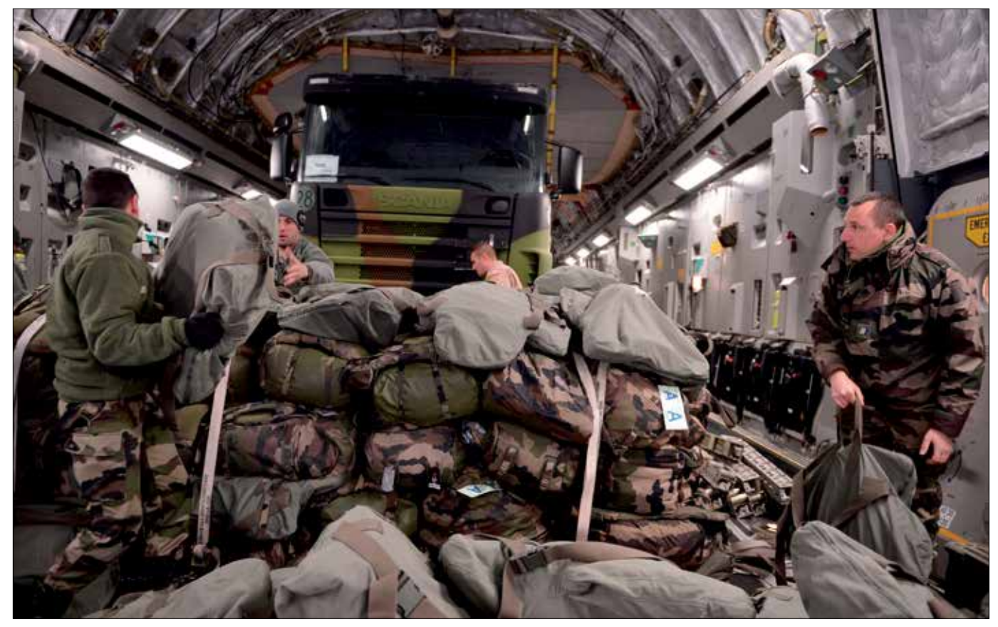
U.S. Airmen and French soldiers load equipment inside U.S. Air Force C-17 Globemaster III in Istres, France, January 21, 2013

requirements associated with light wheeled armor. Indeed, given the generally poor infrastructure in countries such as Mali and France's weak logistical capabilities, anything that reduces the logistics burden is an advantage.