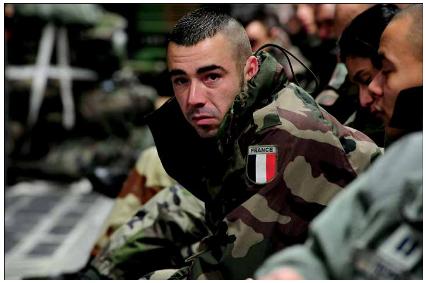
French soldier sits aboard U.S. Air Force C-17 Globemaster III en route to Mali, where French forces were fighting extremists who took control of much of north of country, January 20, 2013

types. A captain commands the force. GTIAs are larger, composed of four companies-three infantry and one armored, or vice versa-with a command element and those support elements deemed necessary. A colonel commands. Additional platoons or companies can be tacked on as needed up until the task force reaches a limit of eight. In Mali, several GTIAs operated simultaneously, each with distinct areas of operation or missions and all under the command of a brigade-level headquarters established in theater, led by a brigade commander. Thus, the French created a provisional Serval brigade. Only some of the forces participating in the operations, it should be noted, are from the brigade commander's home brigade.