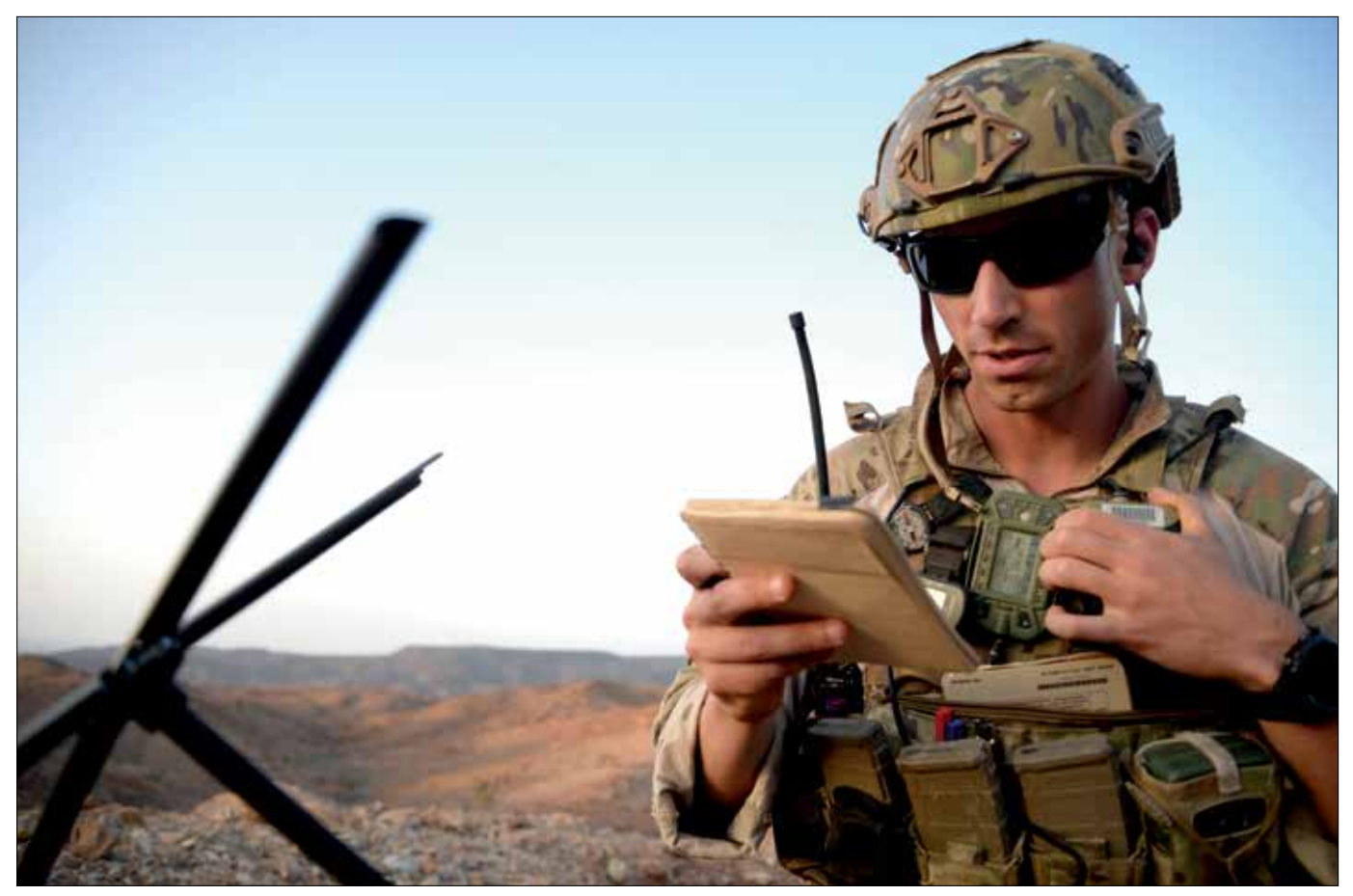
U.S. Airman communicates with French air force pilots during tactical exercise in Djibouti, February 24, 2016

keep the most forward-deployed troops in northern Mali supplied with water and at times fell below the required 10 liters per man, per day. The extreme heat reduced significantly the lift of aircraft, obliging the French to rely on convoys of trucks.<sup>33</sup> There, the problem was that the bottled water reached Gao in containers, but the trucks that took the water north of Gao could not handle containers, and there was a limit to how many crates of bottled water could be loaded on their beds before they fell off while driving over the rough terrain (there are no paved roads north of Gao). The French would not have managed had they not jury-rigged walls for the truck beds using wooden pallets.34