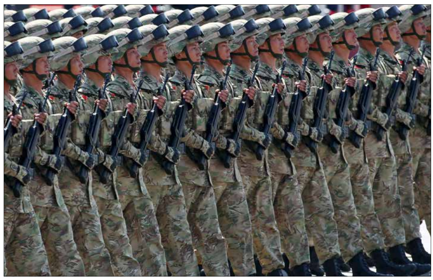
Chinese troops during military parade marking 70<sup>th</sup> anniversary of victory of "Chinese People's Resistance against Japanese Aggression and World Anti-Fascist War" at Tiananmen Square, Beijing, September 3, 2015

the PLA carried out a major propaganda offensive to cultivate a reform mindset among rank-and-file PLA personnel.<sup>20</sup> An anti-corruption campaign was also under way within the PLA, targeting both senior and more junior officers (known colloquially as "tigers" and "flies"). This latter effort served to put the PLA on notice that resistance to reform would not be tolerated.