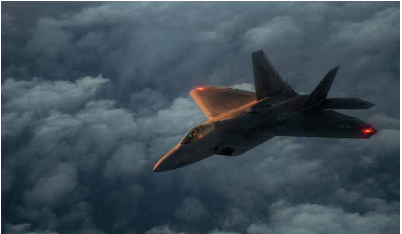
U.S. Air Force F-22 Raptor flies over Arabian Sea in support of Operation Inherent Resolve , January 27, 2016

In response, DOD should consider focusing on three lines of effort. Regarding surface combatants, promising options include deploying new long-range combination land-attack/anti-ship missiles to a range of surface combatants, submarines, and aircraft (such as the B-2 and B-21), adding the ability to conduct vertical launch system reload under way or in forward anchorages (so as to improve the overall combat potential of the fleet and enable distributed and forward logistics), and disaggregating some combat power into new classes of small surface combatants (ranging from the Navy's proposed frigate to fast attack craft).