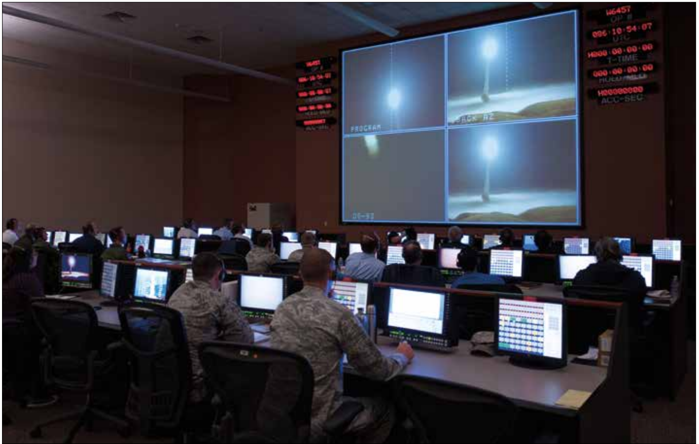
Members of 576 th Flight Test Squadron monitor operational test launch of unarmed Minuteman III missile, March 27, 2015, at Vandenberg Air Force Base, California

sea, as a combination of ship-borne and land-based defenses poses the same problem for naval strike missions.