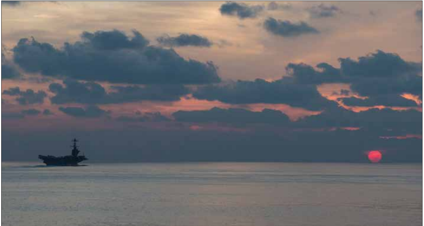
USS John C. Stennis steams at dusk in South China Sea, supporting security and stability in Indo-Asia Pacific, April 25, 2016

as well as inputs from more detailed tactical modeling, to better represent the effects of large-scale forces on a battlefield. Campaign-level modeling is essential in developing insights on the performance of the entire joint force and in revealing key dynamic relationships and interdependencies. These insights are instrumental in properly analyzing complex factors necessary to judge the adequacy of the joint force to meet capacity requirements, such as the two-war construct, and to make sensible, informed trades between solutions. Campaign-level modeling is essential to the force planning process, and although the Services have their own campaign-level modeling capabilities, OSD should once more be able to conduct its own analysis to provide objective, transparent assessments to senior decisionmakers.