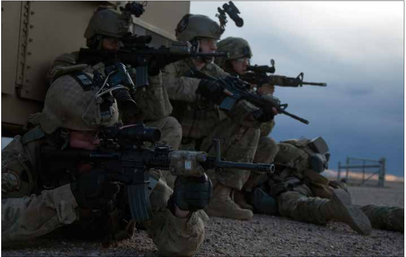
Defenders from 790 th Missile Security Forces Squadron Tactical Response Force take up defensive positions, April 14, 2016, as they prepare to advance toward launch facility during exercise in F.E. Warren Air Force Base, Wyoming, Missile Complex

further complicating its ability to support the defense of Taiwan.