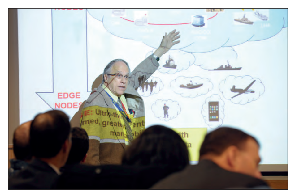
Office of Naval Research head of C4ISR explains suite of information technology tools

China is making an effort to establish a strategic petroleum reserve. In 2010 it had a commercial storage capacity