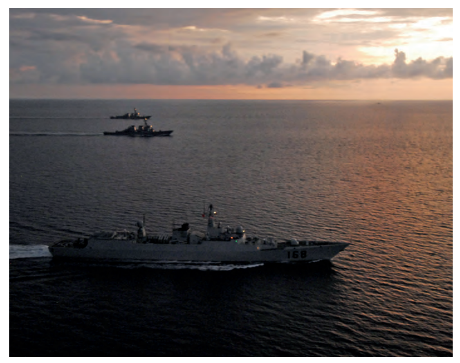
USS Fitzgerald and USS McCampbell maneuver with People's Liberation Army Navy destroyer Guangzhou off coast of North Sulawesi, Indonesia

For the United States, these conditions are a blueprint for a strategy that can both serve as an effective deterrent and as a means to coerce an aggressor should deterrence fail. While the likelihood of a U.S. conflict with the People's Republic of China (PRC) seems remote, China provides fertile ground for comparison to Imperial Japan. The country is heavily industrialized, has a large and