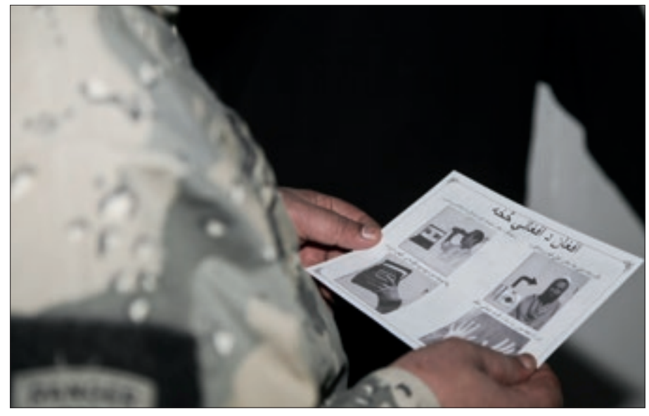
Border police at Wesh review information flier about Afghan 1000 Biometrics Facility

The use of biometrics in identifying IED makers and emplacers has been an ongoing achievement, first in Iraq and now in Afghanistan.