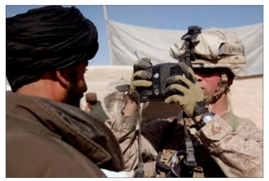
Marine gathers identification information from Afghan during census patrol in Helmand Province

It did not matter that the Afghan police officers who identified and apprehended him could not read or write. What did matter was that by using the earliest form of biometric identification, facial recognition, the officers removed a dangerous bomb maker from the battlefield, making the area safer for not only coalition and Afghan security forces, but