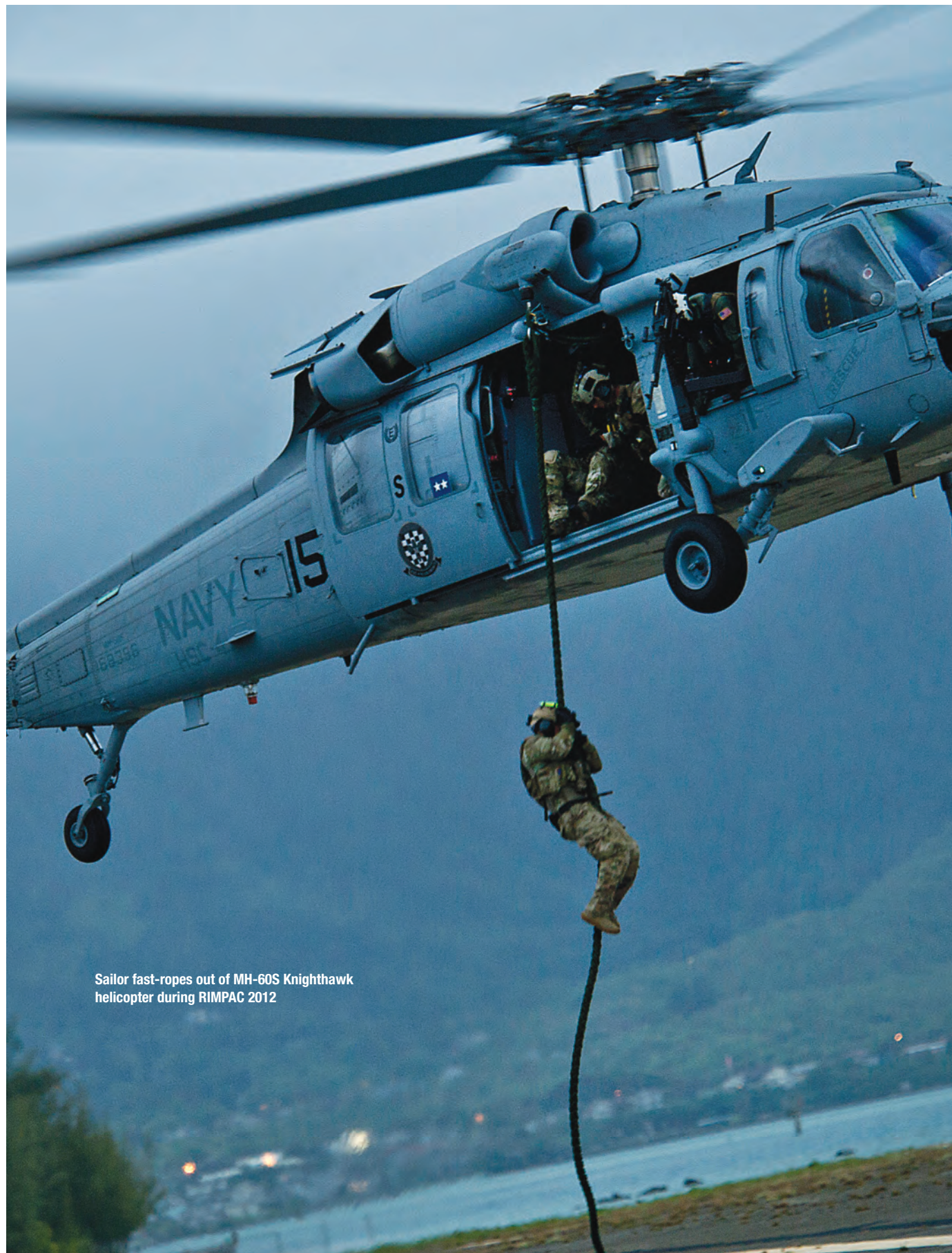
Sailor fast-ropes out of MH-60S Knighthawk helicopter during RIMPAC 2012