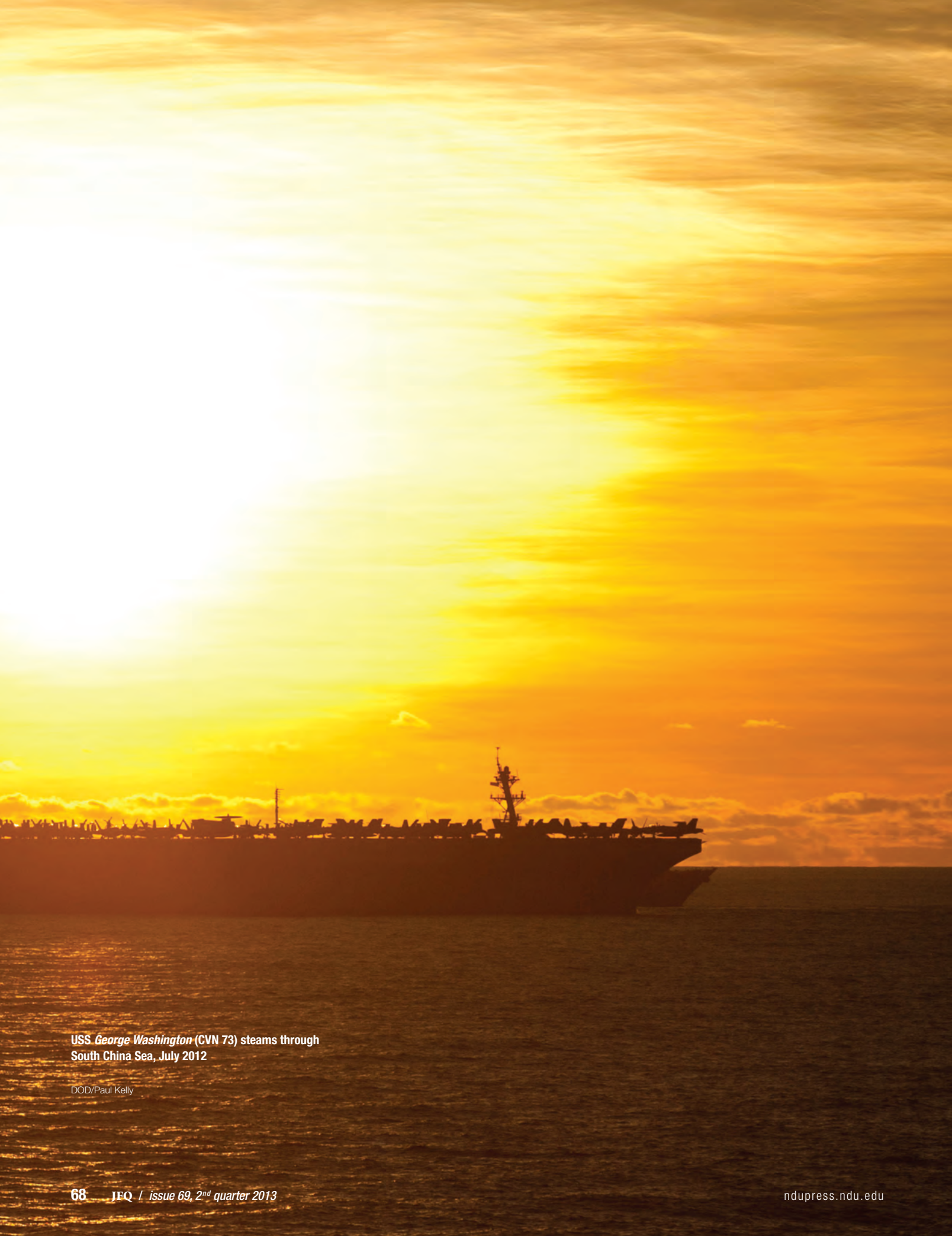
USS George Washington (CVN 73) steams through South China Sea, July 2012