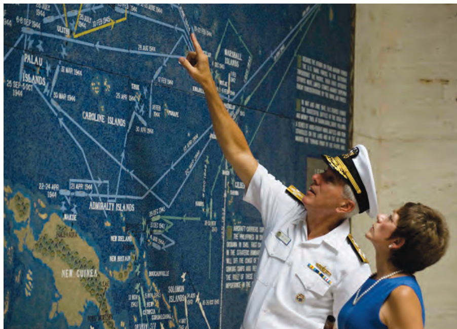
Admiral Locklear visits Republic of the Philippines

Admiral Locklear: Personally, I think that the invitation to RIMPAC for the Chinese was overdue. In and of itself, the invitation is a reassuring activity. When I consider the USPACOM AOR and I speak to our partners, they understand that the rise of China will have an impact on the AOR. We understand that, too. A nation can go from being a prospective Third World country to an economic superpower in just a few decades without it having an impact on the economic environment, social environment, or security environment. The USPACOM community of nations in the