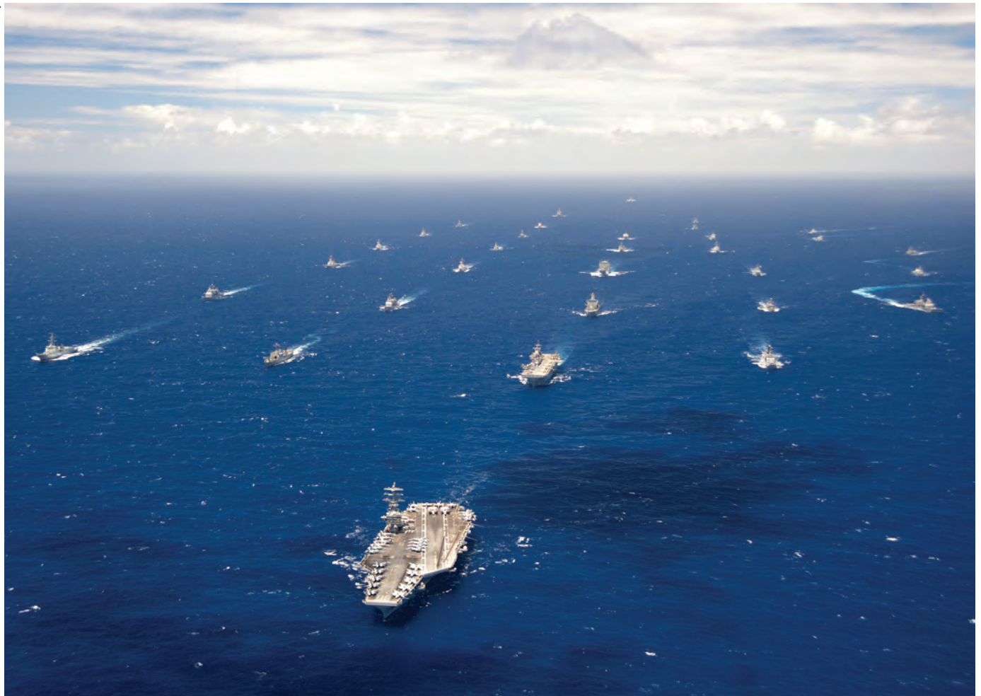
Ships and submarines participating in RIMPAC 2012 sail in formation around Hawaiian Islands, July 2012